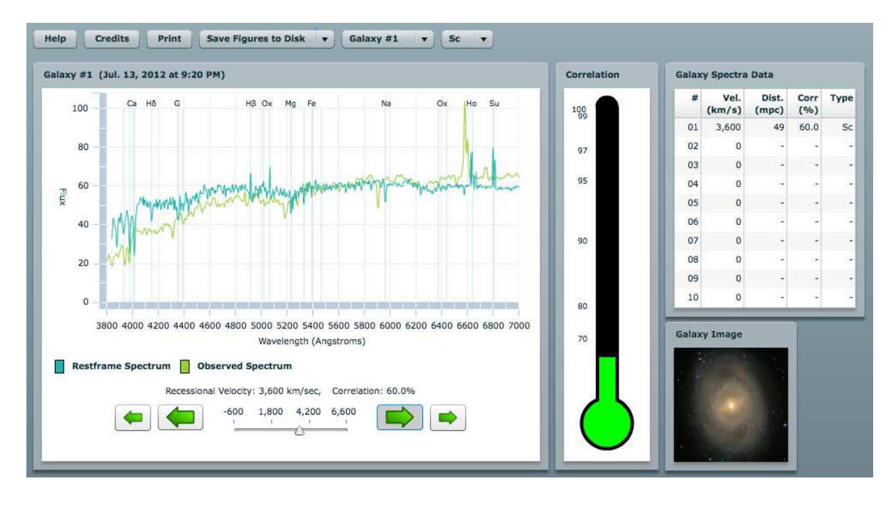
Figure 8.3: A screen capture of our galaxy spectrum analysis tool. Students determine galaxy redshifts by shifting the galaxy spectrum left and right in wavelength so as to match up absorption and emission features, as well as the general shape of the continuum, to a rest-frame spectrum of a galaxy of the selected morphological type. The correlation coefficient is reported numerically and also shown graphically on a symbolic thermometer – the better the match between the two spectra, the higher the level of the green "liquid" in the thermometer.