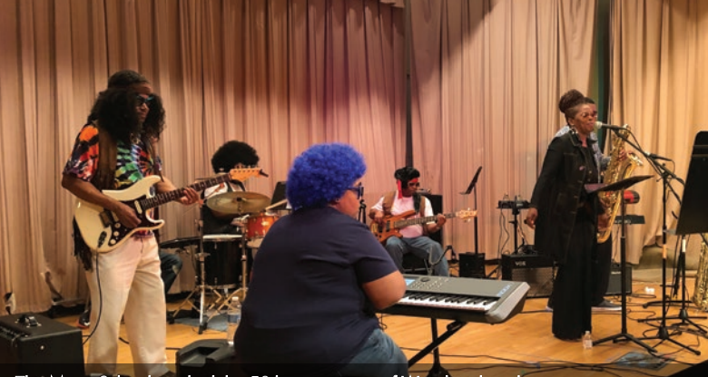
The Music School marked the 50th anniversary of Woodstock at the Cultural Crossroads event Woodstock at 50 , featuring faculty performers, guest artists and groups, with beading and tie-dye workshops. Pictured are The Fuzaholics performing music by Sly and the Family Stone. April 2019.

Enrolled students come from 185 public and private schools, or are homeschoolers, or adults. Two main branches, five satellites, and over 20 outreach sites reach statewide, with regional impact. Nearly 90 expert artists and educators make up our faculty.