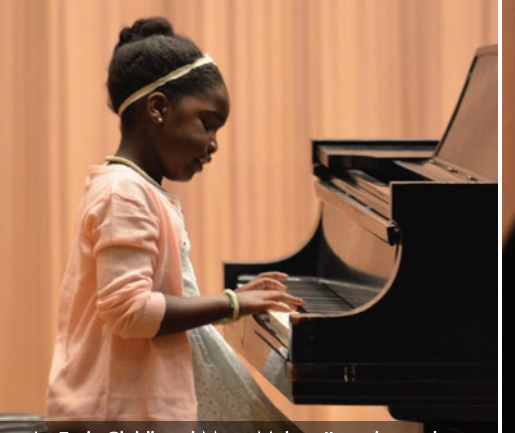
An Early Childhood Music Makers II graduate plays her piece at the Early Childhood Graduation in Wilmington, May 2019.