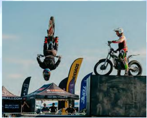
International Motorcycle Show