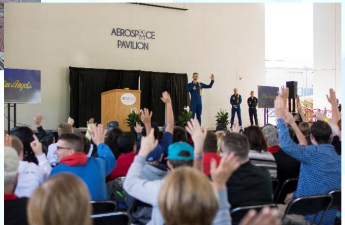
Aerospace Pavilion stage