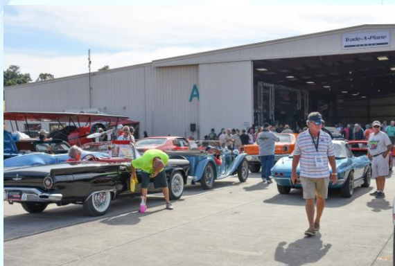
Car Auction (above) 5K Muddy Run (below)