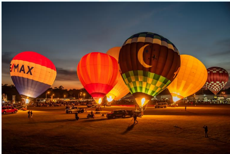
Hot Air Balloon Festival