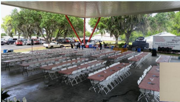
Aerospace Pavilion "audience" area

Atmosphere/Decor: Covered, outdoors, tree canopy, modern design