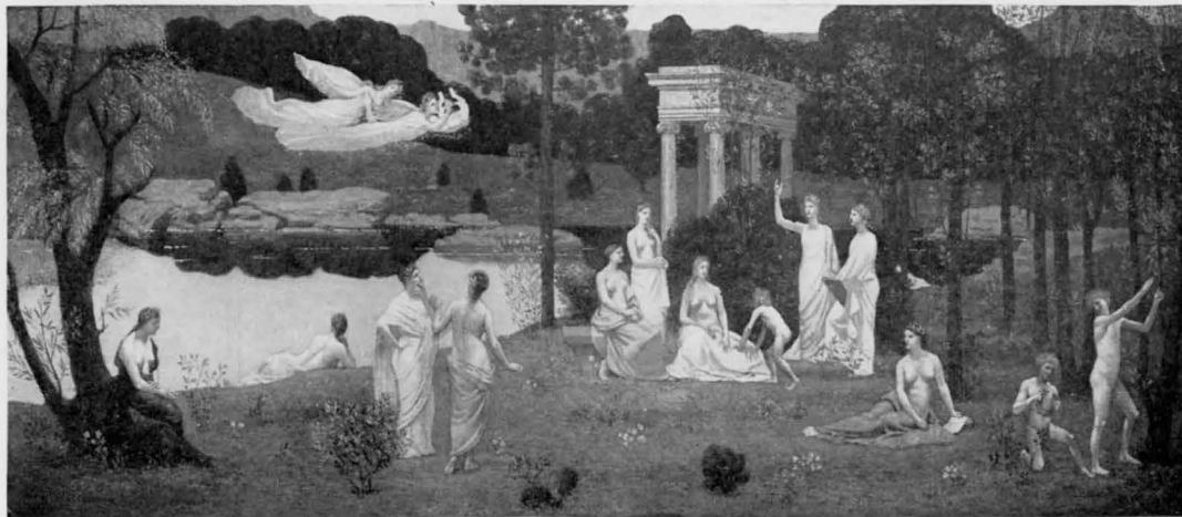
THE SACRED GROVE By P. C. PUVIS DE CHAVANNES FROM THE POTTER PALMER COLLECTION