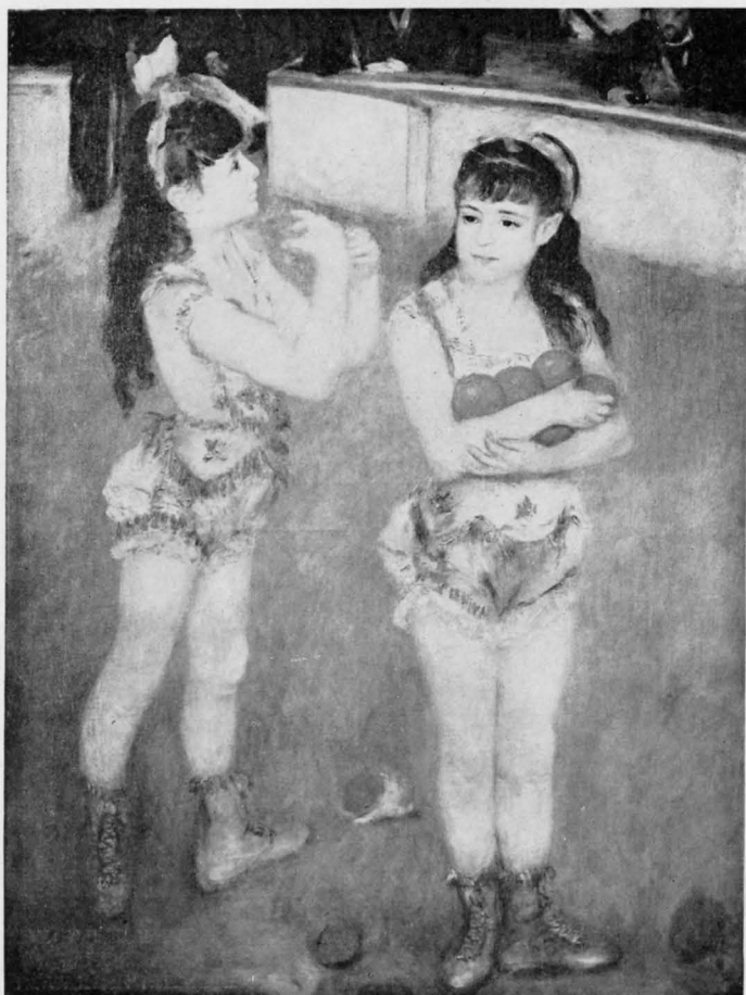
TWO LITTLE CIRCUS GIRLS By AUGUSTE RENOIR FROM THE POTTER PALMER COLLECTION