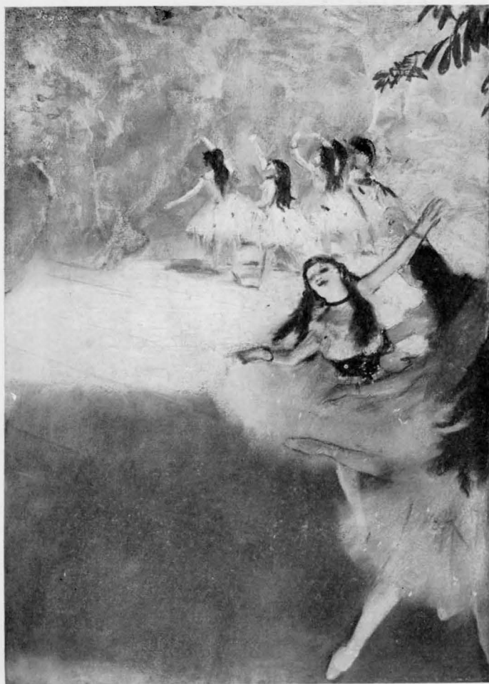
BALLET GIRLS ON THE STAGE By EDGAR DEGAS FROM THE POTTER PALMER COLLECTION