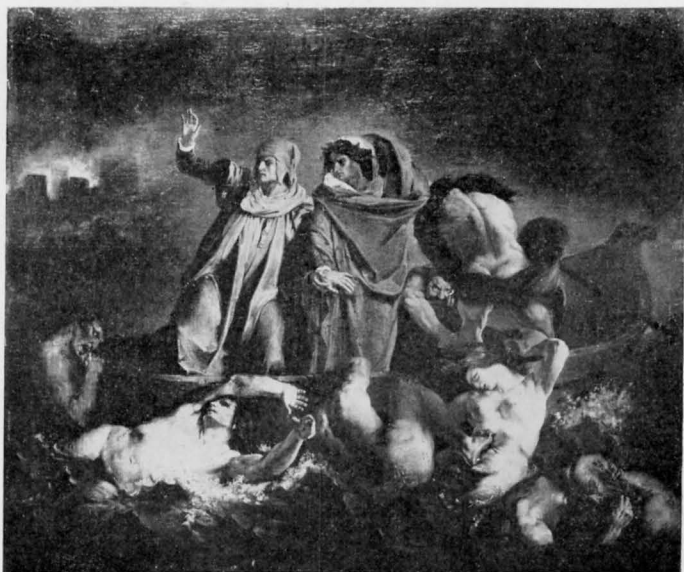
DANTE AND VIRGIL ON THE LAKE OF DIS By EUGÈNE DELACROIX FROM THE POTTER PALMER COLLECTION