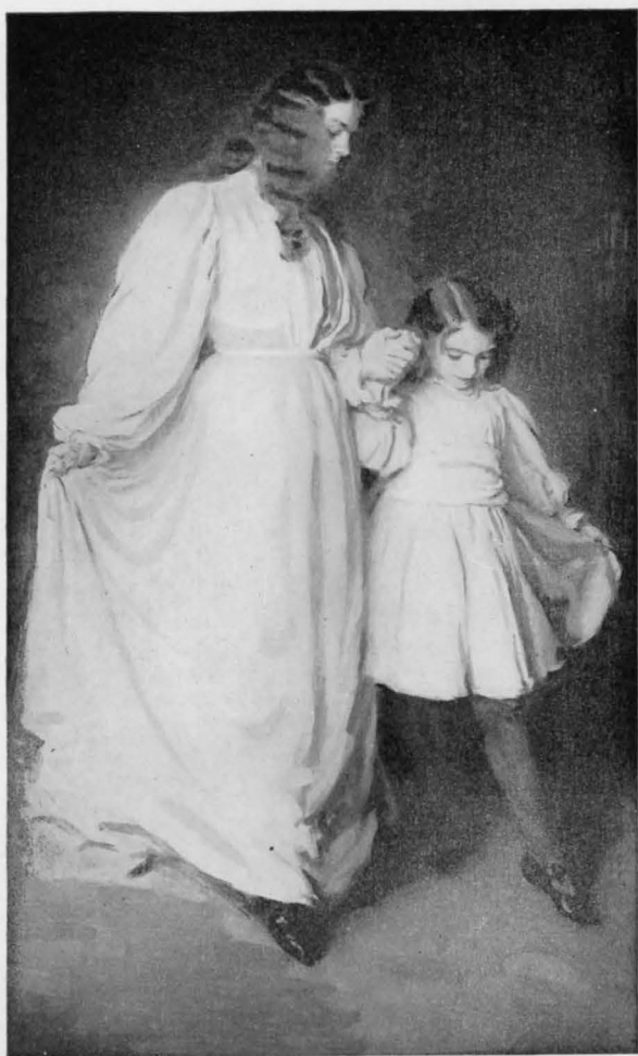
THE DANCING LESSON By CECILIA BEAUX FRIENDS OF AMERICAN ART, 1921