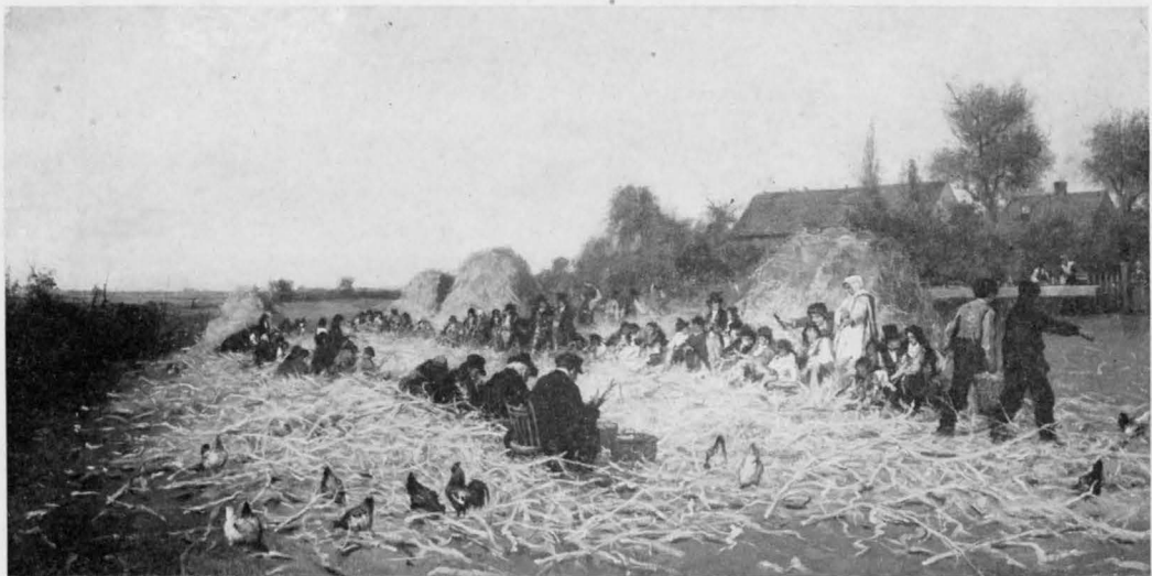
CORN - HUSKING By EASTMAN JOHNSON FROM THE POTTER PALMER COLLECTION