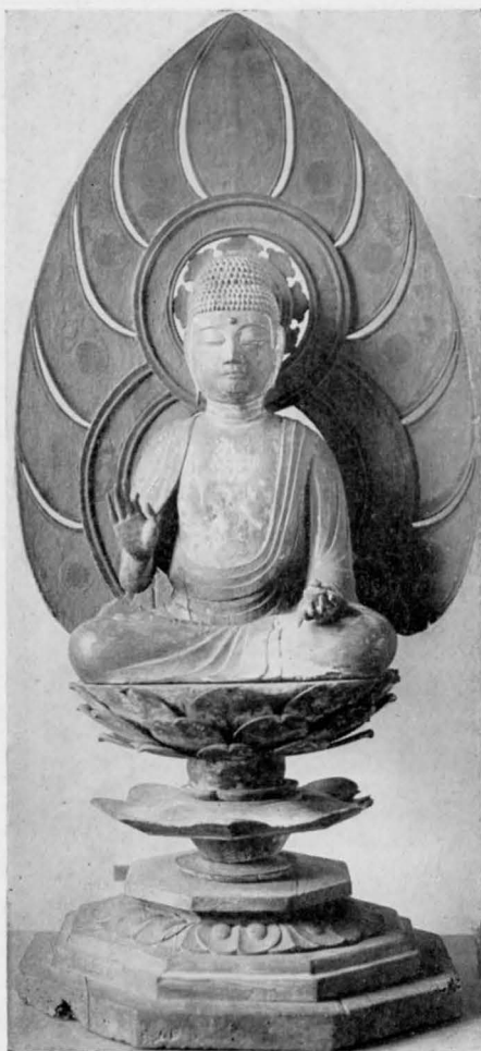
KUAN-YIN OF THE FUJIWARA PERIOD PURCHASED FOR THE NICKERSON COLLECTION