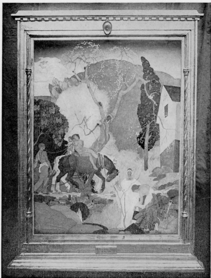
ARBOR DAY By EUGENE SAVAGE FRIENDS OF AMERICAN ART, 1921