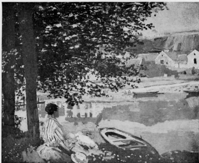
ARGENTEUIL - SUR - SEINE By CLAUDE MONET FROM THE POTTER PALMER COLLECTION