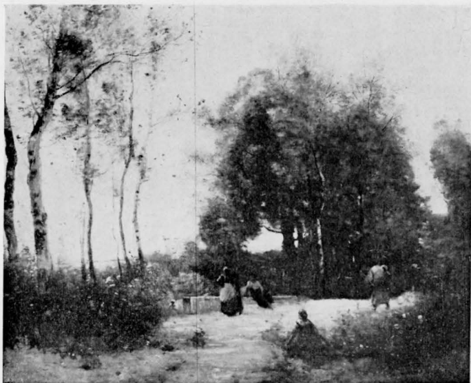
ARLEUX-PALLUEL (THE BRIDGE OF TRYSTS) By CAMILLE COROT FROM THE POTTER PALMER COLLECTION