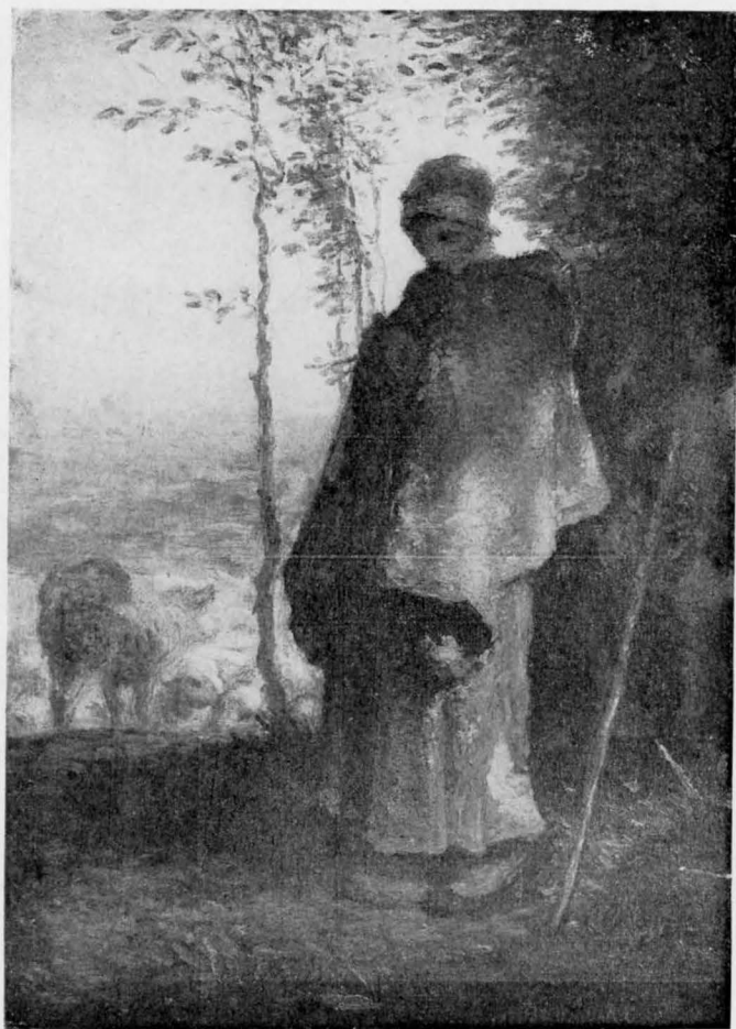
THE LITTLE SHEPHERDESS By JEAN FRANÇOIS MILLET FROM THE POTTER PALMER COLLECTION