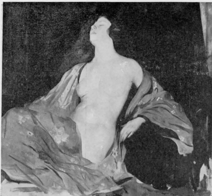
A MODEL By LEOPOLD GOULD SEYFFERT FRIENDS OF AMERICAN ART, 1921