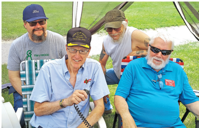
The Newton Amateur Radio Association Inc., W0WML, used an Icom IC-7300 and a 12 V battery for power with a G5RV antenna strung between two large trees.

Niagara Frontier Radiosport KD2KEH 6 5 3 80 WNY