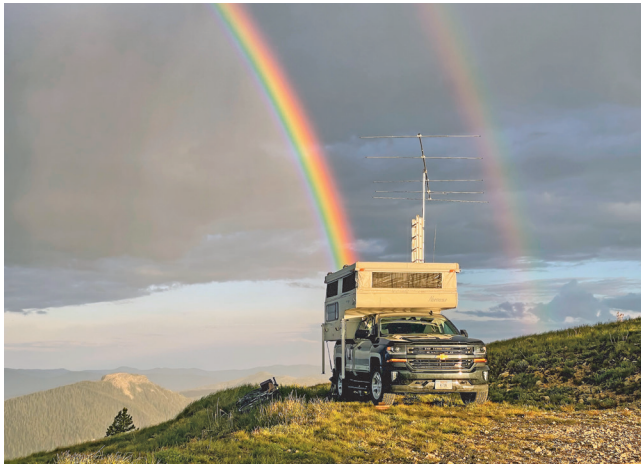
Vick, K7VK, operated from this big sky Montana perch in Class 1B. No gold, but a rainbow is better than a lightning bolt.