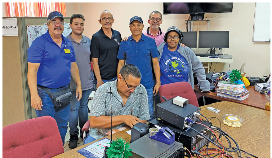
Sweet Fruits On Air Amateur Radio Club, KP4SFA, operated from Puerto Rico in the 2F category.

Checklogs — 113 entries were listed as checklogs if they were missing the required list of calls sorted by band and mode (also known as a dupe sheet), showing that no duplicates were counted twice in their total QSO counts, or by simply sending us the log (even after reminder emails were sent to obtain this list). Checklogs are acknowledged at the bottom of the page at https://field-day.arrl.org .