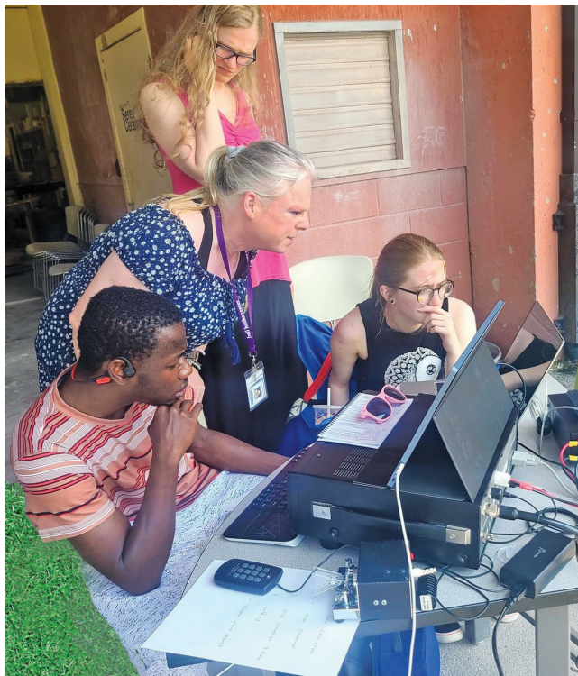
Students from Berea College in Kentucky, operating as AD4AX in the 1A category.