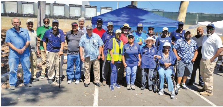
The Los Angeles Amateur Radio Club participated in the 3A category. They received a Certificate of Recognition for their efforts to make a difference in the 65th Assembly District.