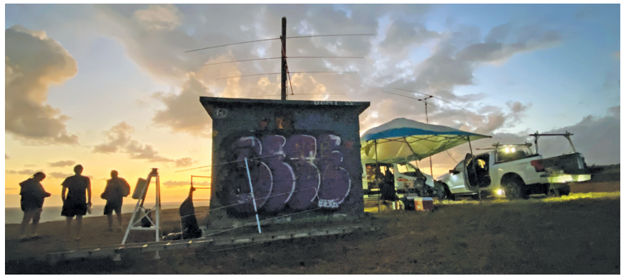
The Maui Amateur Radio Club, KH6RS, operated in Class 2A at the site of a World War II Navy radio station on the North Shore of Maui, Hawaii. This was their view at dawn on Sunday morning.