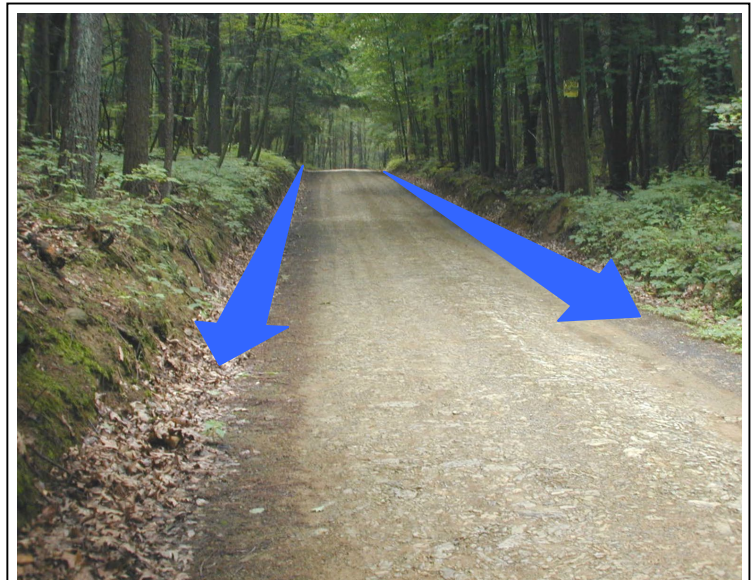
Photo 1: When the elevation of the road is lower than the surrounding terrain, drainage on the road is trapped. As this drainage flows downhill, it generally increases in both volume and velocity. This results in erosion of road material away and causes more frequent road maintenance.