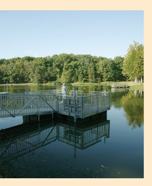
Anglers find plenty of room to cast at Randolph County Lake. The popular site attracts visitors seeking great fishing—and solitude.

Story By Joe McFarland