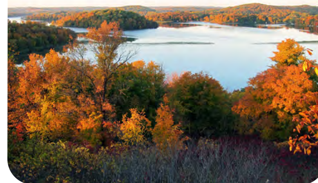
Find incredible views at Hallaway Hill.

Changes in elevation, numerous lakes and ponds, and a mix of forest and prairie offer you a spectacular setting for canoeing, fishing, hiking, horseback riding, camping and more during your stay.