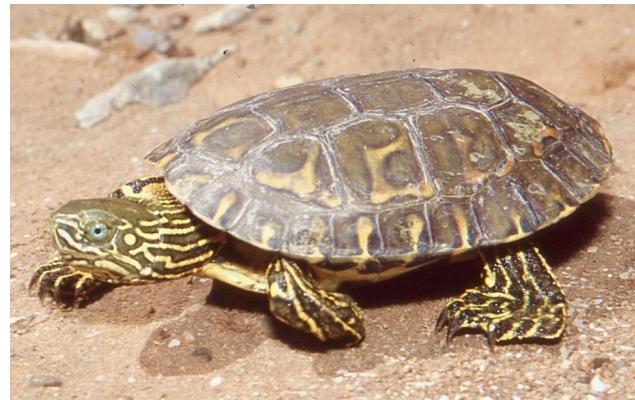
Figure 3. Mauremys leprosa saharica , Bou-Jerif, Morocco.