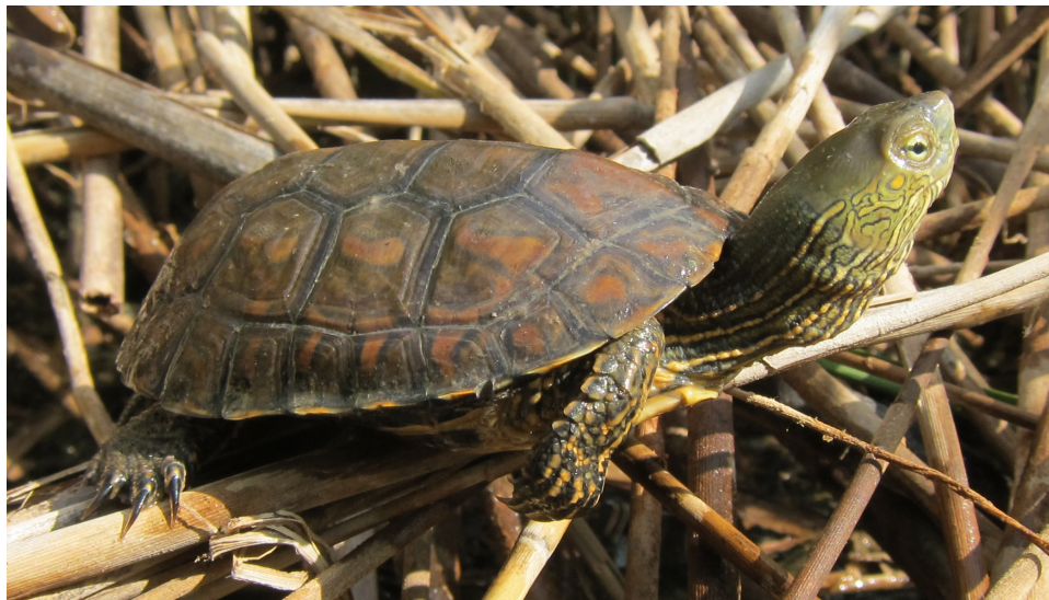
Figure 1. Juvenile Mauremys leprosa leprosa , Flix, Catalonia, Spain.

species names for various populations of this turtle were proposed by Spix (1824), Michahelles (1829), and Gray (1830, 1831, 1854, 1860, 1869a,b), but all were subsequently found to be synonymous with leprosa (see also Wermuth and Mertens 1961). Duméril and Bibron (1835) also described Emys sigriz as “new”, but that name is also a synonym of leprosa and properly attributed to Michahelles (1829). Loveridge and Williams (1957) provided an extensive synonymy and treated leprosa as a subspecies of Clemmys caspica , but presented no discussion for this assignment. McDowell (1964), in his revision of the turtle families Emydidae and Bataguridae (= Geoemydidae), assigned European members of the genus Clemmys to the genus Mauremys , a name first used for the synonymous Mauremys laniaria Gray (1869a). Busack and Ernst (1980) considered the analysis of 17 protein systems provided by Merkle (1975), coupled with their detailed morphological analysis, as support for the decision to assign full species status to Mauremys leprosa .