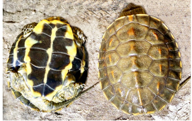
Figure 5. Hatchling Mauremys leprosa leprosa at Center de Recuperació d'Amfibis i Rèptils de Catalunya, Spain.

specimens determined locus polymorphism as 10.8% in each assemblage, with mean heterozygosity per locus as 0.04 in the southern Spanish assemblage and 0.14 in the northern Moroccan assemblage. Unbiased genetic distances ( \hat{D} ; Nei 1978) both within, and between continental assemblages were essentially zero, and between-continent migration rates