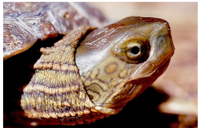
Figure 7. Juvenile Mauremys leprosa leprosa , southeast of El Ksiba, Beni Mellal, Morocco.