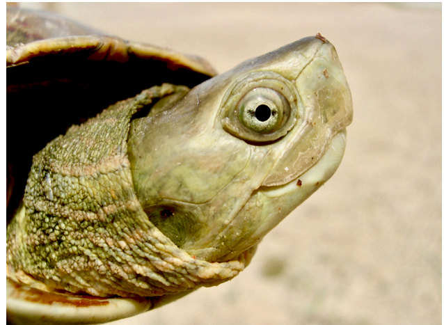
Figure 6. Adult female Mauremys leprosa leprosa , Flix, Catalonia, Spain; as females age their head coloration becomes uniform.