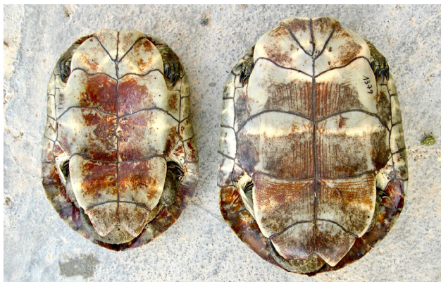
Figure 2. Adult male (left) and female (right) Mauremys leprosa leprosa , Flix, Catalonia, Spain.

Utilizing data from mitochondrial cytochrome b , its control region, and a nuclear intron (R35), Veríssimo et al. (2016) identified two major lineages (A and B) (corresponding to the two recognized subspecies), each with three sublineages, within an analysis of 566 samples from throughout the taxon’s range. Sublineage A1 is distributed in