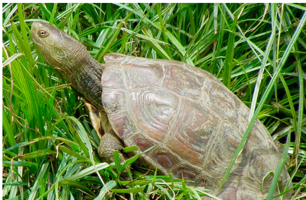
Figure 4. Mauremys leprosa saharica , Tlemcen National Park, Ras Oued El Garsa, M'sila, Algeria.

Any discussion of intercontinental expansion and dispersion of M. leprosa requires consideration of the Strait of Gibraltar (Busack 1977, 1986). Electrophoretic examination of 37 loci within 30 protein systems (non-specific esterases, enzymes, and plasma proteins) from Spanish (Facinas, Benalup de Sidonia, and Río Hozgarganta [Cádiz Province]) and Moroccan (Ksar es-Seghir, Asilah, and Chefchaouen [Tanger-Tétouan-Al Hoceima Region])