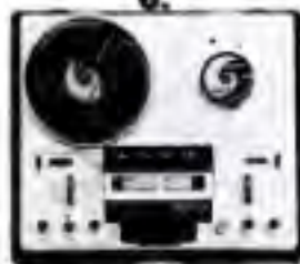
The Uher 8000