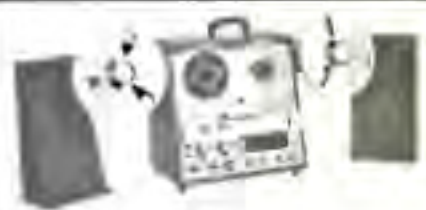
BELL RT 360

Tape speeds — 1\frac{1}{8} , 3\frac{1}{8} and 7\frac{1}{2} ips. Heads — three. Motors — one. Record — 4-track mono and 4-track stereo. Playback — full, 2- and 4-track mono and 4-track stereo. Frequency response — 30 to 18,000 cps. Meters — two neon lights. Weight — 39 lb. Other features — self-contained carrying case; 2 microphone and 2 radio-phono inputs; 3 speaker and 2 preamp outputs; automatic 20 cps tone operated, reverse play; automatic take-up reel threading; automatic cut off switch; slide projector sync using external sync device; 2 built-in speakers. Price — $499. Available as deck from $439 to $469.