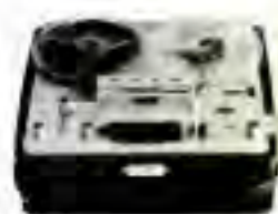
The Uher 7000