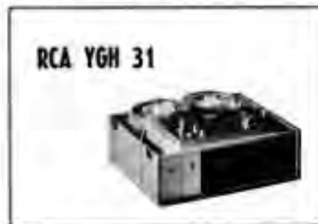
RCA YGH 31

Tape speeds — 1½ and 3¾ ips. Heads — four. Motors — one. Record — 4-track mono. Playback — 4-track mono. Frequency response — 50-15,000 cps. Indicator — meter. Weight — not available. Other features — self-contained carrying case; cartridge machine; microphone and radio-phonograph inputs; preamp output; automatic shutoff; built-in speaker; all transistor. Price — $99.95.