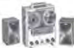
AMERICAN CONCERTONE 805

Tape speeds — 3\frac{1}{8} and 7\frac{1}{2} ips. Heads — six. Motors — three. Record — 4-track mono, 4-track stereo. Playback — 4-track mono, 4-track stereo. Frequency response — 30-18,000 cps. Indicators — 2 meters. Weight — 60 lb. Other features — walnut case; 2 microphone and 2 radio-phono inputs; 2 preamp and 2 stereo headphone outputs; automatic reverse record and play; echo effects; sound-on-sound; two separate, bookshelf speakers. Price — $699.50. Deck Model 806, preamps only, $549.50.