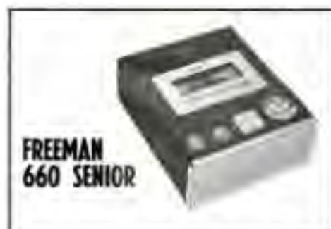
FREEMAN 660 SENIOR

Tape speeds — 1½ and 3¾ ips. Heads — two. Motors — one. Record — 2-track mono. Playback — 2-track mono. Frequency response — 50-10,000 cps. Indicator — meter. Weight — 6 lb. Other features — powered by 6 D-cell batteries or AC adapter; remote control microphone input; external speaker output; voice actuated recording; slide projector sync; manual tape speed control for movies. Price — $179.95. Model 320 , without slide projector sync, but with built-in AC adapter, $129.95.