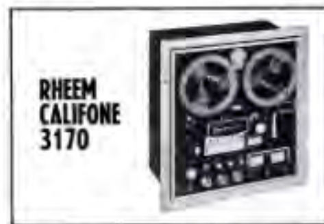
RHEEM CALIFONE 3170

Tape speeds — 1½, 3¾ and 7½ (15 optional) ips. Heads — two. Motors — one. Record — 4-track mono and 4-track stereo. Frequency response — 40-18,000 cps. Indicator — meter. Weight — 30 lb. Other features — 2 microphone and 2 radio-phonograph inputs; deck with preamps and monitoring amplifiers only; 2 preamp, 2 speaker and 2 headphone outputs. Price — $189.95.