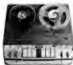
The Uher 5000