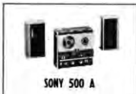
SONY 500 A

Tape speeds — 3\frac{3}{4} and 7\frac{1}{2} ips. Heads — three. Motors — one. Record — 4-track mono and 4-track stereo. Playback — 4-track mono and 4-track stereo. Frequency response — 30-18,000 cps. Indicators — none. Weight — 12 lb. Other features — deck with transport only; designed for use with Sony Amplifier (SRA-2L). Price — less than $119.50.