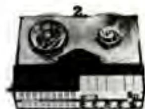
The Uher 4000