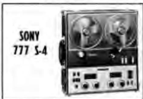
SONY 777 S-4

Tape speeds — 3\frac{3}{4} and 7\frac{1}{2} ips. Heads — three. Motors — one. Record — 4-track mono and 4-track stereo. Playback — 4-track mono and 4-track stereo. Frequency response — 30-18,000 cps. Indicators — 2 meters. Weight — 44 lb. Other features — self-contained carrying case; deck, with preamps only; 2 microphone (or magnetic cartridge) and 2 radio-phono inputs; 2 preamp and headphone outputs; sound-on-sound; automatic shutoff; and monitoring. Price — less than $450.