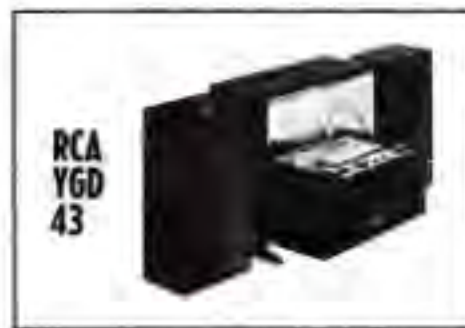
RCA YGD 43

Tape speeds — 1½, 3¾ and 7½ ips. Heads — two. Motors — one. Record — 4-track mono. Playback — 4-track mono. Frequency response — 50-15,000. Indicator — meter. Weight — not available. Other features — self-contained carrying case; microphone and radio-phonograph inputs; preamp output; built-in speaker. Price — $129.95.