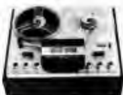
The Uher 9000 Tape Deck