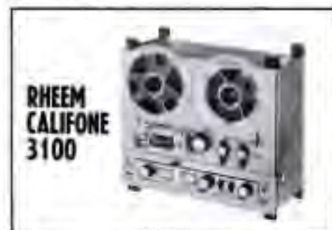
RHEEM CALIFONE 3100

Tape speeds — 1½, 3¾ and 7½ ips. Record — 4-track mono and 4-track stereo. Playback — 4-track mono and 4-track stereo. Frequency response — 50-15,000 cps. Indicator — meter. Weight — not available. Other features — self-contained carrying case; 2 microphone and 2 radio-phonograph inputs; 2 preamp, 2 external speaker, headphone outputs; sound-with-sound; automatic shutoff. Price — $229.95; Model MGG 72, deck with preamps only, $189.95.