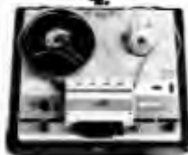
The Uher 6000