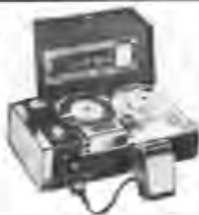
FANON- MASCO FTR 403F

Tape speeds — 1½ and 3¾ ips. Heads — two. Motors — one. Record — 2-track mono. Playback — 2-track mono. Frequency response 150-6000 cps. Indicator — meter. Weight — 5 lb. Other features — powered by 6 penlight batteries or with optional AC adapter; remote control microphone and radio-phonograph inputs; external speaker output; built-in speaker. Price — $99.95.