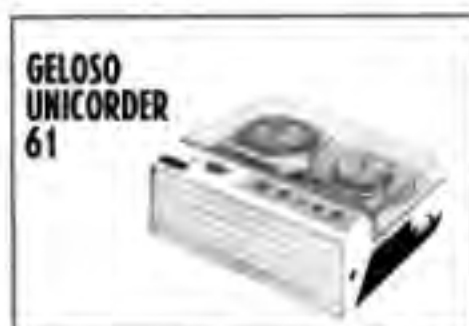
GELOSO UNICORDER 61

Tape speeds — 1½ (with special capstan sleeve) 3¾ and 7½ ips. Heads — two. Motors — one. Record — 2-track mono. Playback — 2-track mono. Frequency response — 65-15,000 cps. Indicator — meter. Weight — 8½ lb. Other features — powered by 6 penlight batteries or AC with built-in adapter; remote control microphone and radio-phonograph inputs; earphone and external speaker outputs; stroboscope control 3¾ and 7½ ips; and built-in speaker. Price — $199.50.