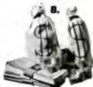
High Protected Profit