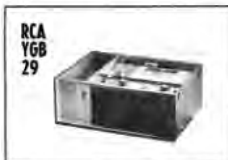
RCA YGB 29

and 4-track stereo. Playback — 4-track mono and 4-track stereo. Frequency response — 40-15,000 cps. Indicators — 2 meters. Weight — 45 lb. Other features — deck with preamps and monitor amplifiers only; 2 microphone and 2 radio-phonograph inputs. Preamp output. Price — $500.