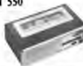
FREEMAN 550 SENIOR

Tape speeds — 1½, 3¾ and 7½ ips. (with optional capstan bushing and pinch wheel kit). Heads — two. Motors — one. Record — 2-track mono. Playback — 2-track mono. Frequency response — 65-12,000 cps. Indicator — meter. Weight — 5½ lb. Other features — powered by 6 penlight batteries or AC with adapter; remote control microphone and radio-phonograph inputs; earphone and external speaker outputs; built-in speaker. Price — $159.50.