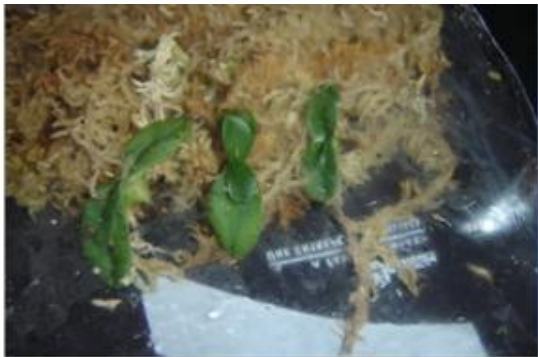
Three rootless plantlets put on the edge of damp mound of sphagnum, enclosed in a zip-lock plastic bag.

Remove both halves. Put on edge in ziplock bag