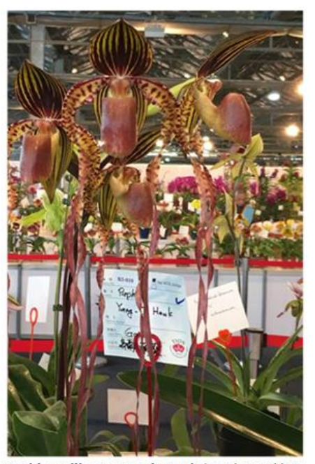
Paphiopedilum Yang-Ji Hawk (Paphiopedilum sanderianum x Paphiopedilum anitum)