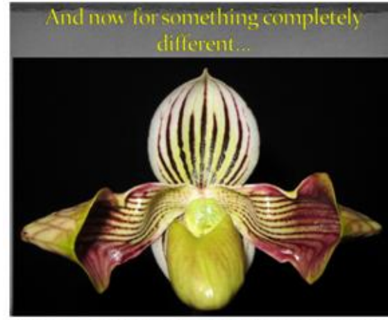
Paph Larry Booth x Paph philippinense peloric clone

Paphiopedilum Reco very (Paphiopedilum sukhakulii Paphiopedilum philippinense), produced a nice green result when