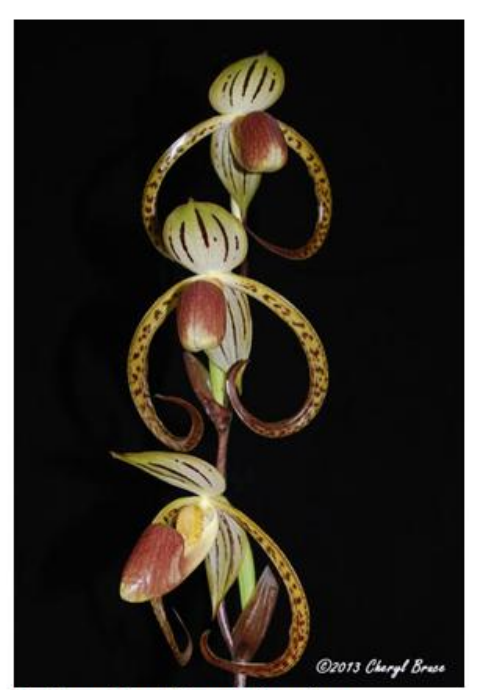
Paphiopedilum Memoria Joan Levy

Paphiopedilum Memoria Joan Levy ( Paphiopedilum stonei x Paphiopedilum gigantifolium ) Cute upside down hearts!