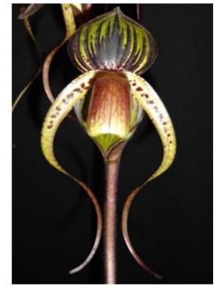
Paphiopedilum Haur Jih Lucky