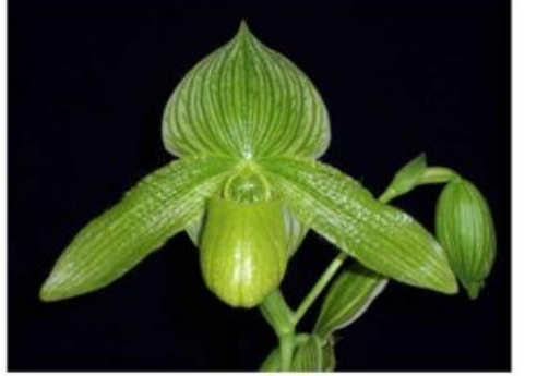
Paphiopedilum Somers Phil 'Rodriguez Negron' AM/AOS was the best result recorded so far. Photo: Irma Selles, O+ 1.4

dark distinct spots usually on flowers with haynaldianum shape. Paphiopedilum Tony Semple album is quite in vogue right now!