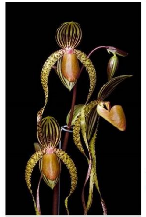
Paphiopedilum Booth's Sand Lady 'Electra' AM/AOS, Photo: Greg Allikas. O+ 1.4

produced cream coloured Paphiopedilum Berenice, a white green and light gold Paphiopedilum Temptation (Paphiopedilum kolopakingii x Paphiopedilum philippinense) where the