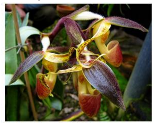
Paphiopedilum gigantifolium, Photo: David Sorokowsky

Another approach is using Paphiopedilum gigantifolium