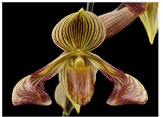
Paphiopedilum Shin-Yi Surprise 'Hawaiian Peloric' AD/AOS, O+ 1.4

A rather different result was obtained by crossing Paph Larry Booth with Paph philippinense. The peloric clone has potential!