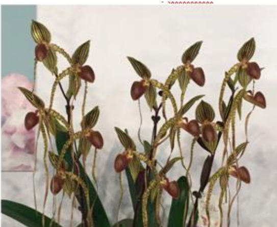
Paph Prince Edward of York with 3 inflorescences coming from about a 6-growth plant