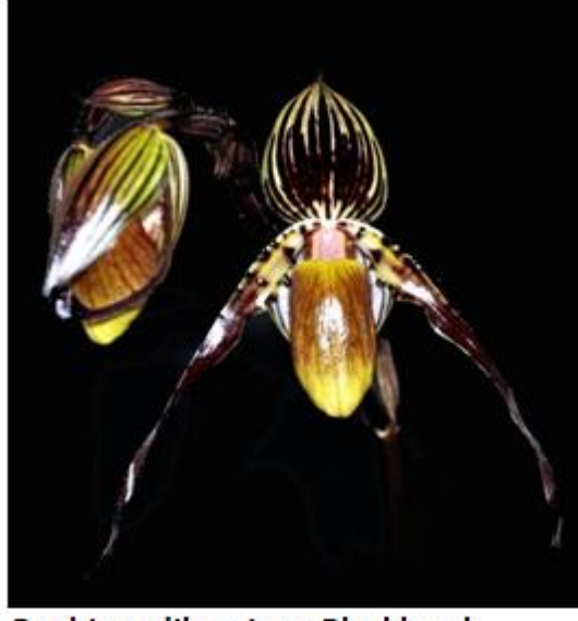
Paphiopedilum Lyro Blackhawk

When you work with St Swithin album you only get 25% albums. Paphiopedilum Toni Semple ( Paphiopedilum haynaldianum x Paphiopedilum lowii ) gives vigorous plants with the best clones showing