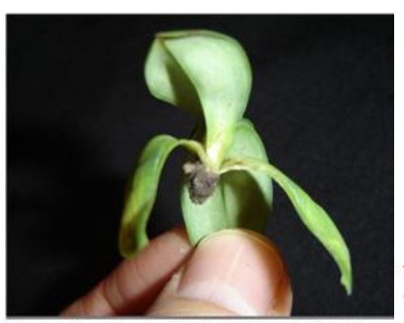
The rootless Paph with its bottom leaf split