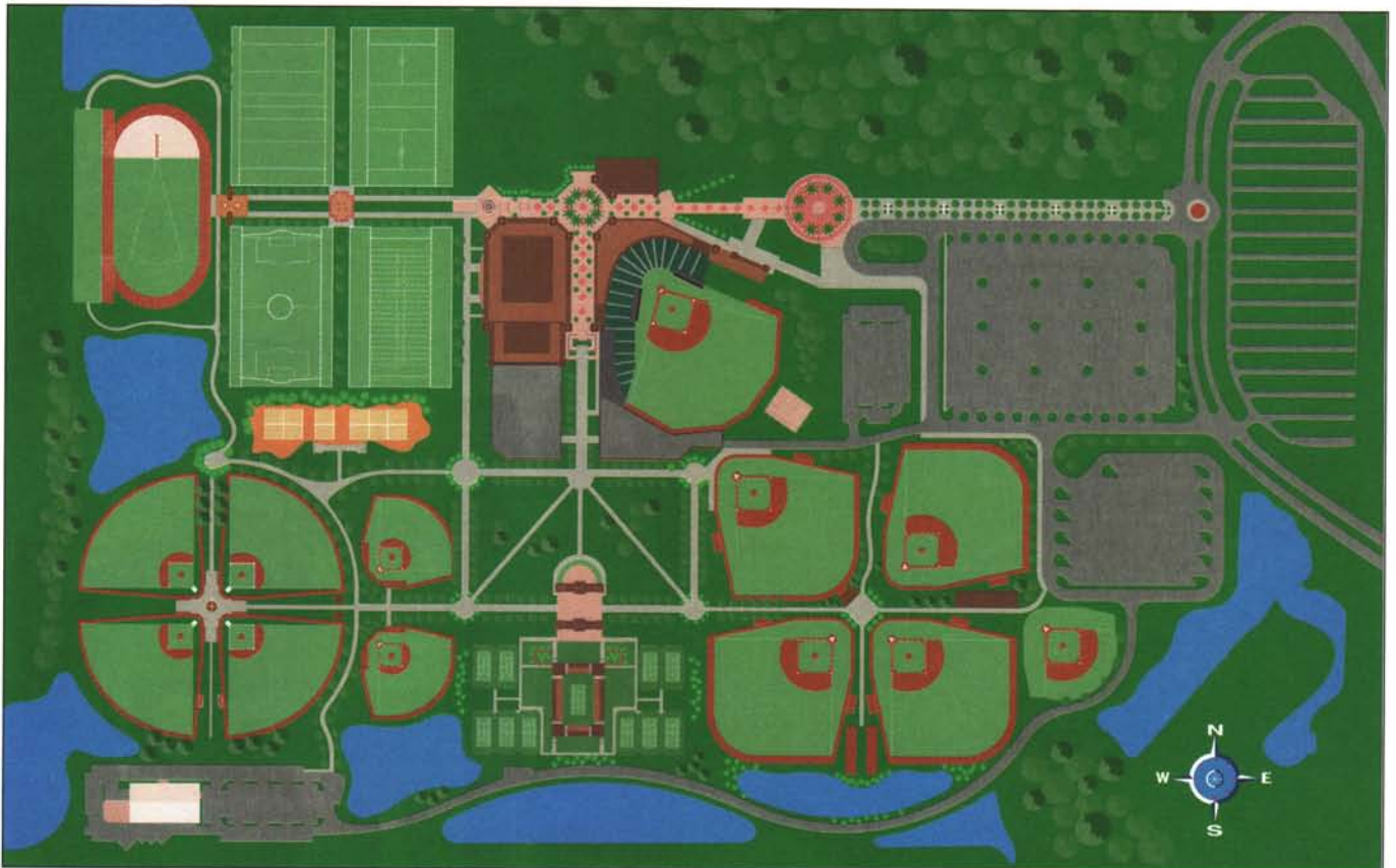
A multi-colored walkway leads visitors from the complex's main entrance between the baseball stadium and fieldhouse to the Town Green, where paths branch out to other ball fields.

That's for starters. As the following listing illustrates, much more is planned.