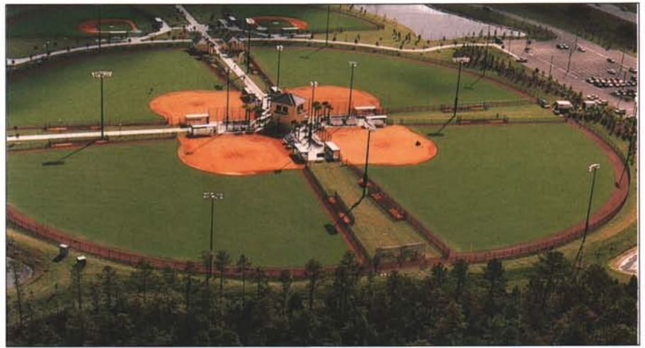
The outfields of the softball quadraplex measure 305 feet in a perfectly symmetrical configuration, but can be shortened when required.

The facility is scheduled to host 27 events this year featuring 10 different softball organizations. One centrally located tower overlooking all four diamonds offers press facilities, concession stands and an area for scorekeepers and officials. Sports Operations Manager: Ken Hackmeister.