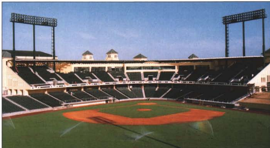
The double-decker baseball stadium was designed to replicate the best any professional stadium has to offer.

The stadium will be managed and maintained under the leadership of turf