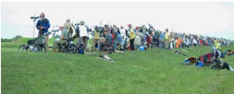
The match was fired on the ranges of Camp Perry during the 2017 National Matches.

The Springfield M1A Match, sponsored by and conducted in collaboration with Springfield Armory, was added to the CMP National Match events in February and provides an additional way for competitors of all ages and experience levels to enjoy the world of marksmanship. The match is set to return in 2018, with plans to be a permanent staple in the CMP National Match lineup.