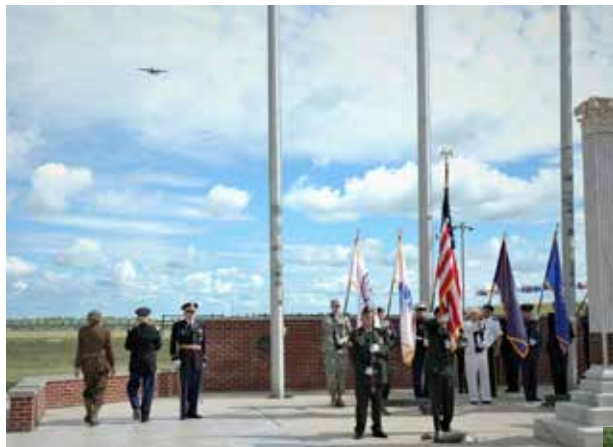
(Above) Military members proudly hold colors as a vintage World War II aircraft soars in the background.