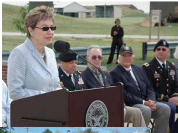
(Top right) Representative Marcy Kaptur of Ohio's 9th congressional district addresses the crowd.