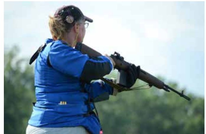
A mix of men, women and juniors lined up to compete in the match.

The Springfield M1A Match, sponsored by and conducted in collaboration with Springfield Armory, was added to the CMP National Match events in February and provides an additional way for competitors of all ages and experience levels to enjoy the world of marksmanship. The match is set to return in 2018, with plans to be a permanent staple in the CMP National Match lineup.