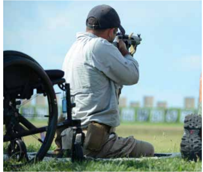
Members of the M1 for Vets team also fired in the event.