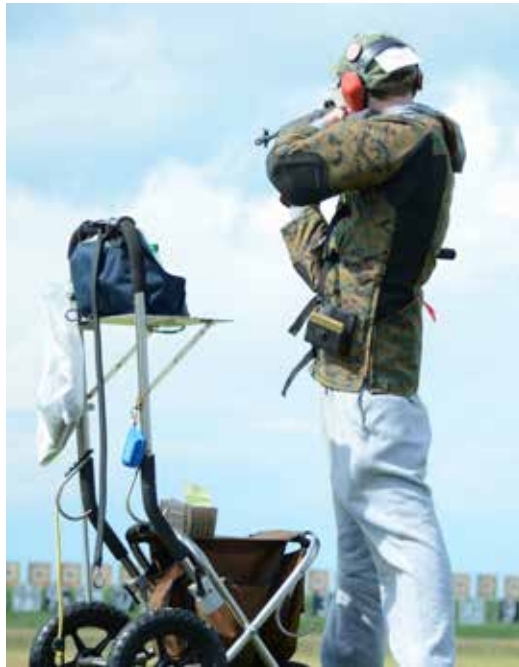
The Springfield M1A Match was added to the CMP Camp Perry lineup in 2017. The match has been held at Camp Perry since 2007.