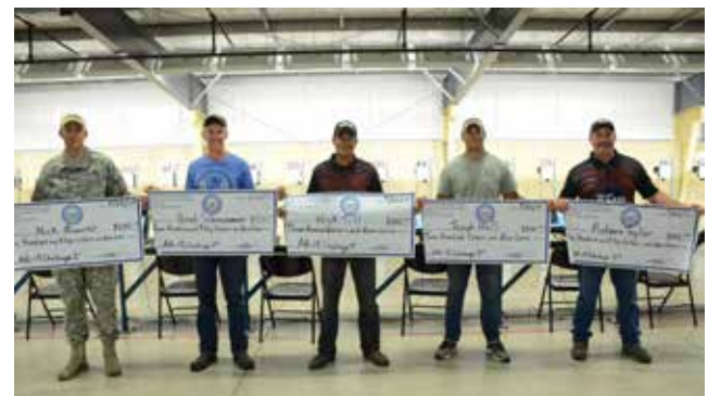
Top places in the AiR-15 Shoot Off each received monetary awards from the CMP.