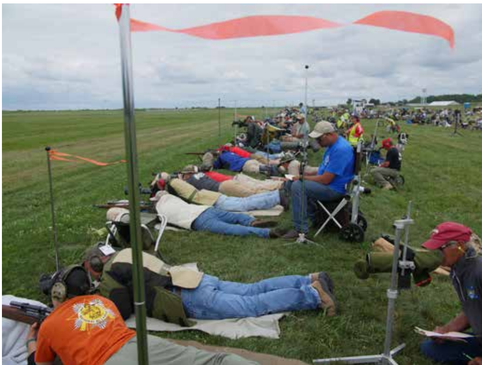
The Vintage Sniper Match was again one of the most popular matches of the Games.

“I didn’t really care about winning. I just wanted to hang out and enjoy the people to my right and my left,” he added. “There were a lot of smiles out there, and if I can make