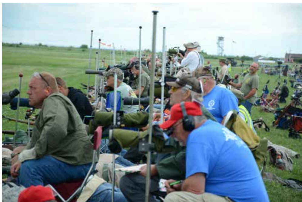
As in past years, many competitors traveled to Camp Perry to fire in the Games events.

Photos of all of the National Match events can be found on the CMP Zenfolio page: http://cmp1.zenfolio.com/f308381592 .