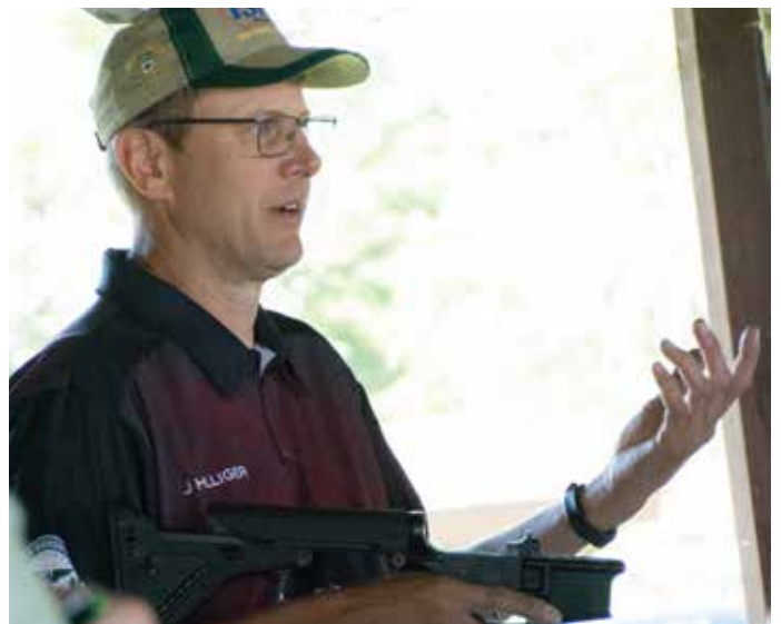
Each year, the class will feature guest instructors who are experts in specific areas of interest.