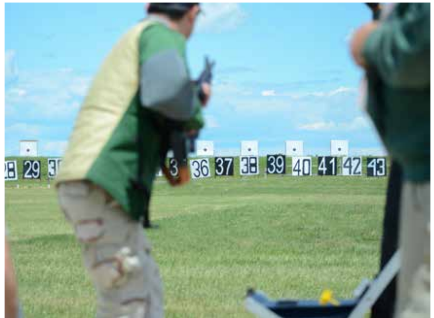
The 4-Man Team Match was the first of an entire week full of successful events fired entirely on the CMP’s electronic highpower targets.