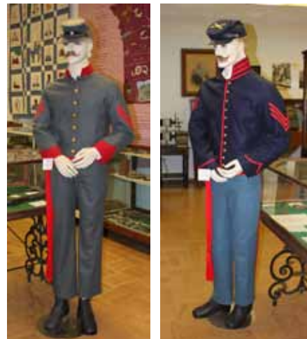
Manikins dressed in the uniforms of the Confederate (left) and Union soldiers. Formerly part of the Stephens Museum of Natural History collection, they are now part of the CMU Museum of History collection. The Union soldier is currently on display; the other manikin is in storage.

For more information about the CMU Museum of History (listings of traveling and temporary collections on display), go to the CMU website: www.centralmethodist.edu and look for “Campus Attractions” under the “About CMU” tab.