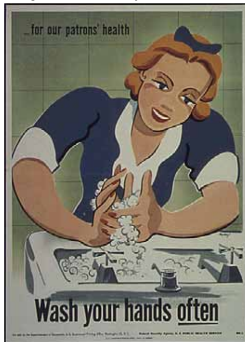
This was a popular poster placed nationwide during the Spanish Flu epidemic of 1918-19.