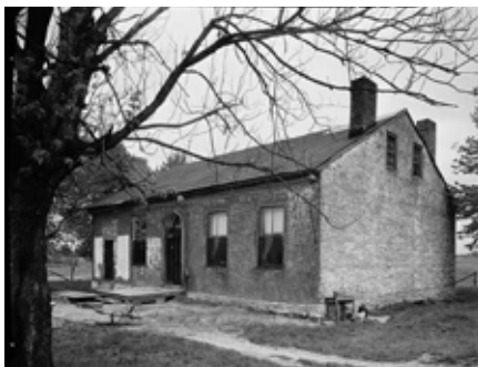
Cover Photo and image at left, taken in 1936: The Thomas Hickman House (1818-19), one of the oldest houses in Howard County and a classic example of Georgian Cottage-style architecture. The house has been restored and placed on the National Register of Historic Places. It is located on the 655-acre Horticulture and Agroforestry Research Center (HARC) operated by the University of Missouri in New Franklin. Tours of the house may be arranged by contacting HARC. Images courtesy of HARC and HABS.

We consider it a prudent step to place the magazine online and reduce the potential for exposure to COVID-19 by persons associated with its production. When the pandemic has ceased to be a public health hazard, we will consider returning the magazine to a hard copy version. Until then, copies of future issues may be seen online at the BHS website: www.boonslickhistoricalsociety.edu . Use the "Quarterly Journal" tab to access all issues published since 2012. You can download any issue to your computer or print it out. —The Editor