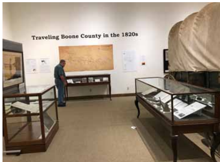
A visitors to Boone County History and Cultural Center views covered wagon and artifacts related to travel methods in Boone County during the early 19th century. The exhibition is sponsored by the Boone's Lick Road Association.