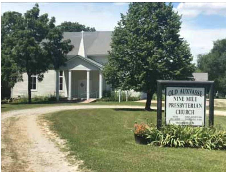
Old Auxvasse-Nine Mile Presbyterian Church.

The log church was replaced by a brick church in 1840. The