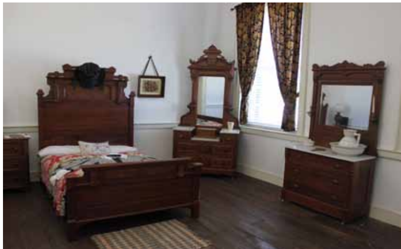
There are two bedrooms with period four-corner beds and furniture that were gifts from area residents.