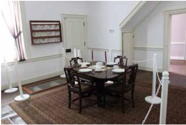
Dining room with a four-place seating and period chairs and table.