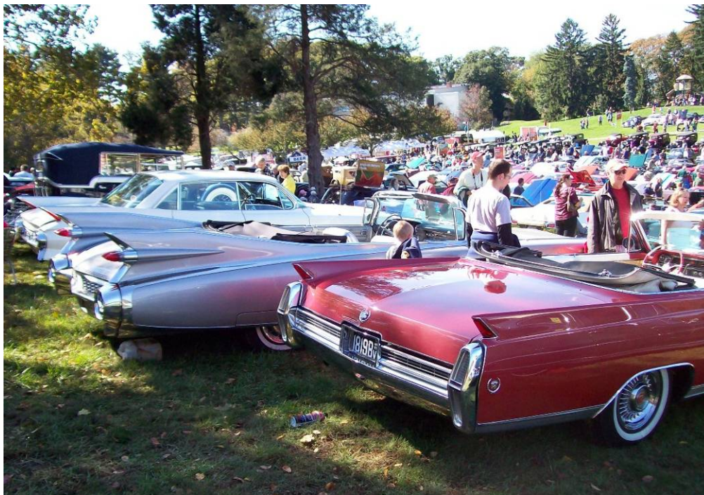
Cadillac row – front and rear!

The City of Rockville, MD celebrated its 50th Antique and Classic Car Show on Saturday, October 15, 2011. And it continued its tradition of being the Washington, DC Metropolitan Area's premier classic car event. For the second straight year, more than 5,000 visitors viewed the over 500 cars assembled on the show field on the picturesque grounds of the historic Glenview Mansion in the Rockville Civic Center Park.