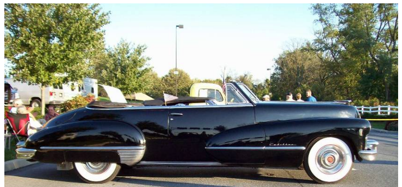
A beautiful 1947 Convertible Coupe for sale