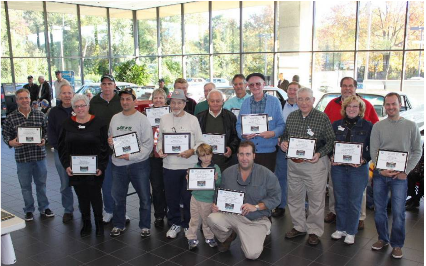
Dazzling DeVille Owners with their Certificates of Appreciation