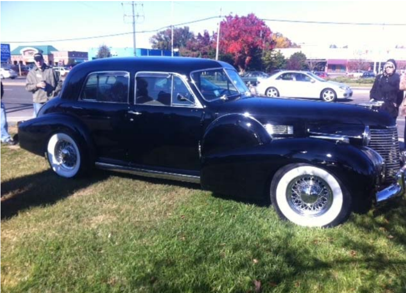
This rare 1940 Series 60 Special sported a division window, dual side mounts, and a 305 Chevy small block V8.