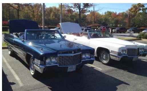
Cheney & Berkeley Edmunds' Two 1970 DeVille Convertibles