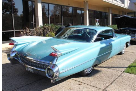
Sandy Kemper's 1959 Coupe DeVille