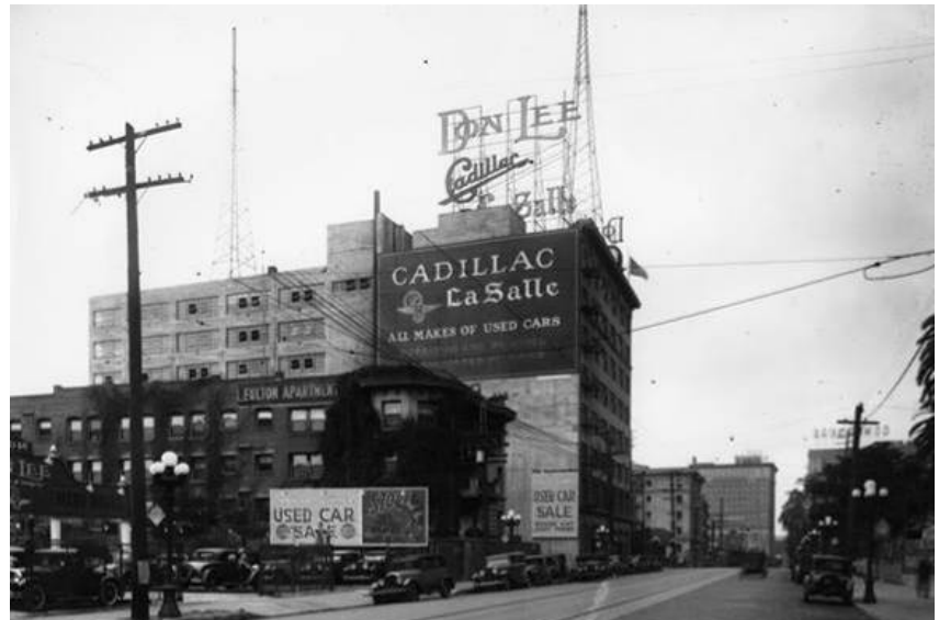
Don Lee Cadillac and LaSalle Circa 1930