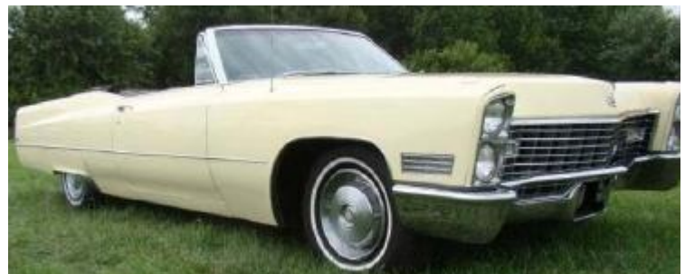
1967 DeVille Convertible in excellent condition

Additional information: Hubert Lowe 443-871-0232 or lowesautomotive@verizon.net