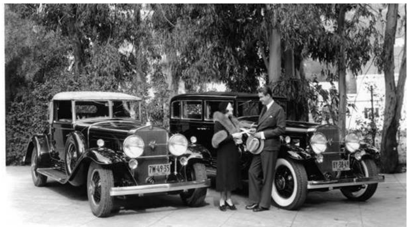
Birthday presents for Frances Marion (pictured left), a prolific screenwriter, and her husband George Hill (pictured right), cinematographer and director. "His and hers" love tokens as only the Hollywood elite had the means and the inclination to exchange.