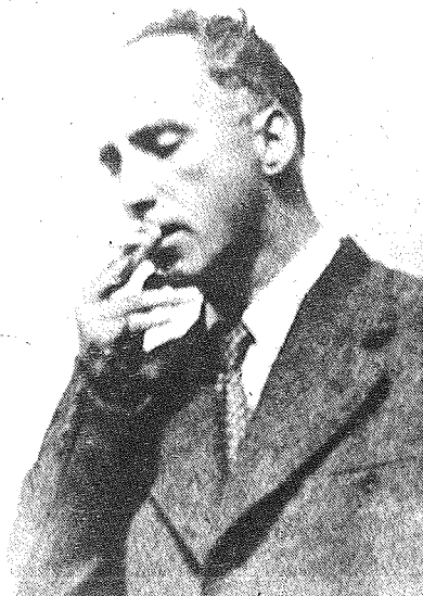
Kurt Huber, born 24.10.1893, arrested 27.2.1943, executed 13.7.1943

God's creatures, his free will; if they abandon the will to take decisive action and turn the wheel of history and thus subject it to their own rational decision; if they are so devoid of all individuality, have already gone so far along the road toward turning into a spiritless and cowardly mass — then, yes, they deserve their downfall. If everyone waits until the other man makes a start, the messengers of avenging Nemesis will come steadily closer; then even the last victim will have been cast senselessly into the maw of the insatiable demon. Offer passive resistance — resistance — wherever you may be, forestall the spread of this atheistic war machine before it is too late, before the last cities, like Cologne, have been reduced to rubble, and before the nation's last young man has given his blood on some battlefield for the hubris of a sub-human. Do not forget that every people deserves the regime it is willing to endure.