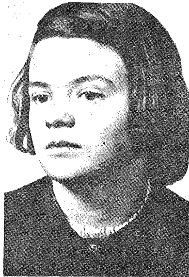
Sophie Scholl, born 9.5.1921, arrested 18.2.1943, executed 22.2.1943