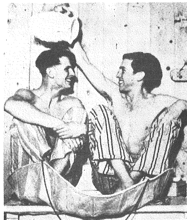
A friendship dating back to schooldays. Christoph Probst, born 6.11.1919, arrested 19.2.1943, executed 22.2.1943, and Alexander Schmorell, born 16.9.1917, arrested 24.2.1943, executed 13.7.1943

was that it gave the appearance of having to oppose its own state, its people, and that people's interests. For many, this entailed a difficult conflict, through which they struggled with difficulty. But not so for my brother and sister; for them no dilemma existed... The defence of common humanity everywhere had to be raised above the interest of the nation... In a war against the individual, against people different from ourselves, and against dissident minorities, the resisters had to show their solidarity with these isolated individuals.