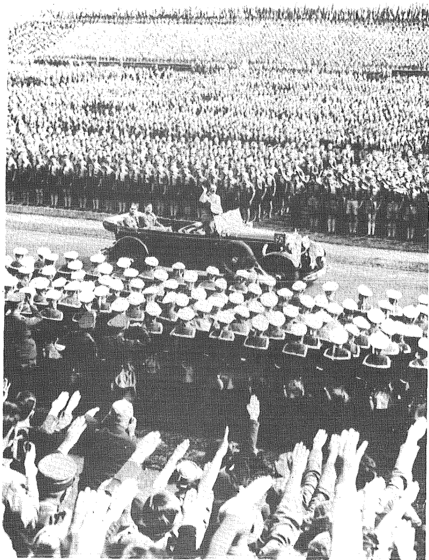
Hitler at a party youth rally at Nuremberg in 1935

On 2 August 1934 President Hindenburg died and three hours later it was announced that Hitler had taken over the powers of Head of State and Chief of Staff of the army. The title of President was abolished – Hitler would be known as Führer and Reichskanzler. He bound the Army to obedience by an oath he hastily extracted from them — an oath of allegiance, not to Germany, nor to Germany's Constitution, but to himself, Hitler.