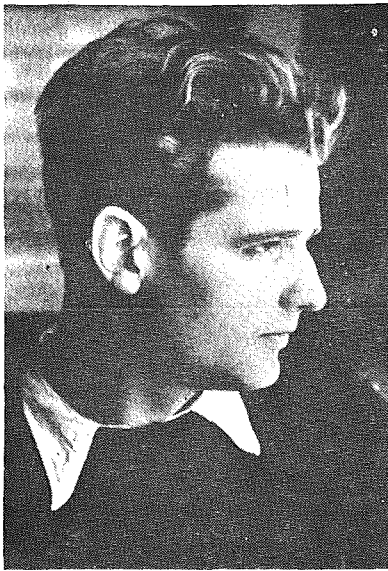
Hans Scholl, born 22.9.1919, arrested 18.2.1943, executed 22.2.1943