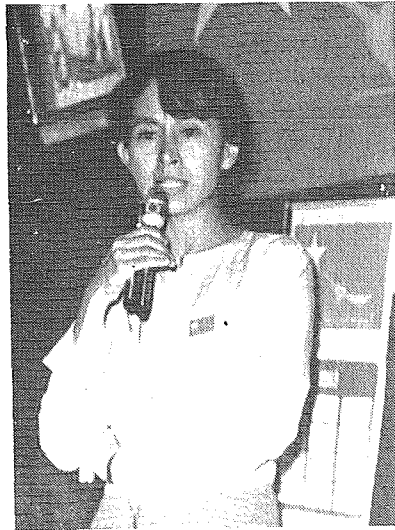
Aung San Suu Kyi One of the thousand public addresses given in 1988-9

Aung San Suu Kyi was awarded the Nobel Peace Prize for 1991. She has never been able to receive it. She has been under house arrest by order of her country's military rulers since 1989. Aung San Suu Kyi is the former leader of the National League for Democracy in Myanmar, previously known as Burma. She was elected to power in 1988 in a landslide popular vote, but was never able to take office because the military intervened, nullifying the results of the election and imposing rule by junta on the country.