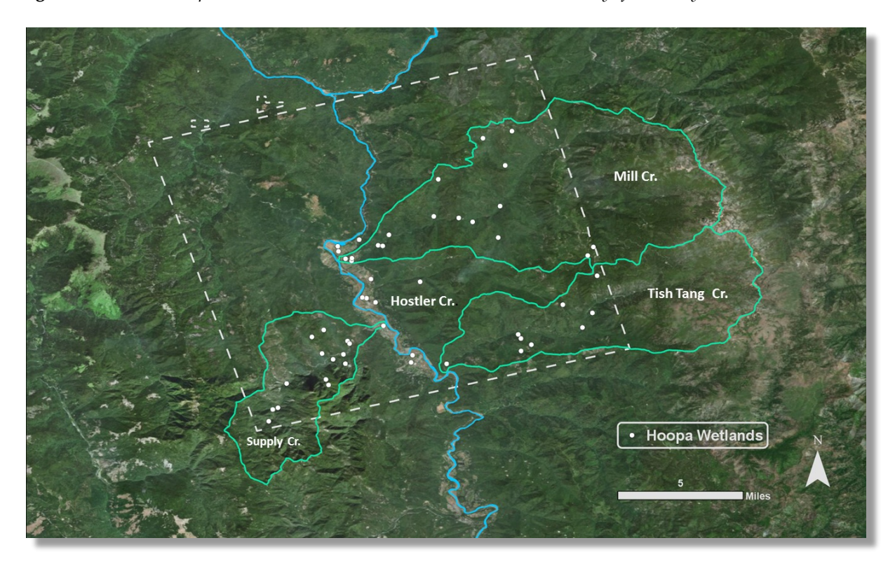
Figure 1.3 – Known or potential wetlands on the Reservation, based on surveys from the year 1999.

Due to the restriction of agricultural, residential and commercial development largely to the valley floor, long-term loss of wetlands in upland areas has probably been minimal, but road construction and logging undoubtedly have caused some wetland losses as well as altering species composition and structure. In contrast, decline in amount or quality of wetlands on the valley floor has probably been significant over the past century due to land use conversions and water diversions. In addition, the Army Corps of Engineers' channelization of many streams following the 1964 flood led to significant loss or decline in quality of valley wetlands.