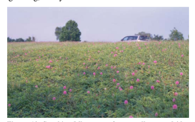
Figure 10. Sunshine Mimosa performs well on roadside right-of-ways, as seen here along I-75.

This drought-tolerant, low-growing wildflower is adaptable to a variety of situations and requires no special management practices to sustain it. Sunshine Mimosa can co-exist with roadside turf (Fig. 10) as well as thrive in the harsh conditions adjacent to the shoulder. And since it so low growing, it stays under the mower blades.