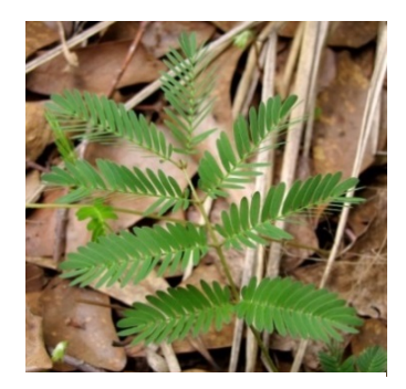
Figure 3. Sunshine Mimosa bipinnately compound leaf.

This groundcover will form a thick mat where there a lot of