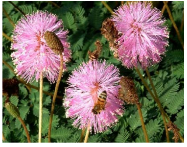
Figure 8. Honey bees are an important pollinator of Sunshine Mimosa.

Sunshine Mimosa (Fig. 8). Based anecdotal observations in Florida (15).they seem to be the main pollialthough nator, "bottle bees" also have been observed (15). In