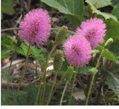
Figure 4. Powderpuff is a common name for M. strigillosa because of the shape of its flowers.

Stems often form roots at nodes. Roots can penetrate deep into the soil, one of the likely reasons that Sunshine Mimosa is drought tolerant once established. Like other plants in the