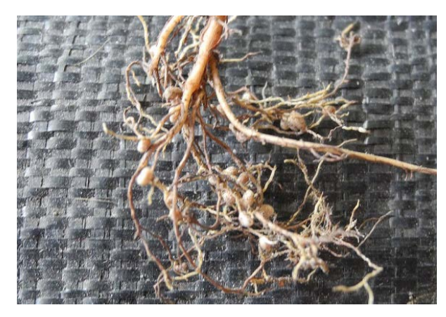
Figure 7. Nodules on the roots of Sunshine Mimosa contain bacteria that convert atmospheric nitrogen into ammonia, a form of nitrogen that the plant can utilize.

Nitrogen-fixing bacteria infect root hairs, the fine white roots at the tips of the root system. Infected roots form nodules in which the bacteria reside (Fig. 7). Nodules most often are seen up to the time of flowering. After that, nodules usually start to deteriorate as the plant's resources are directed to flowering and seed production, not the roots.