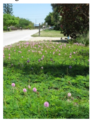
Figure 9. Sunshine Mimosa is a sustainable alternative to turf.

dential and commercial landscapes (Fig. Since it can spread rapidly, it is best used where maintenance is not needed to contain it. As few as four or five 1-gal pots planted in a landscape can cover 200 to 300 sq. ft. in less than a full growing season. rapid spread, dense, mat-like habit, deep root system also make it a good species