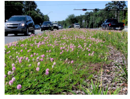
Figure 2. Sunshine Mimosa is a sustainable groundcover in urban settings.

legume (Fig. 2). While it is perennial, subfreezing temperatures will kill the top growth. Shoots that do not die in winter might become somewhat yellowish in the winter.