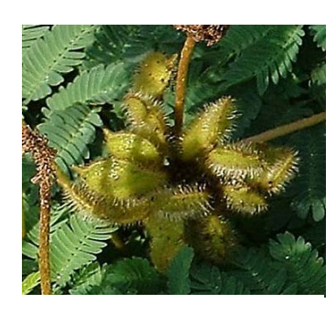
Figure 5. Sunshine Mimosa pods contain up to 3 seed.

The olive brown to brown seed (Fig. 6), on