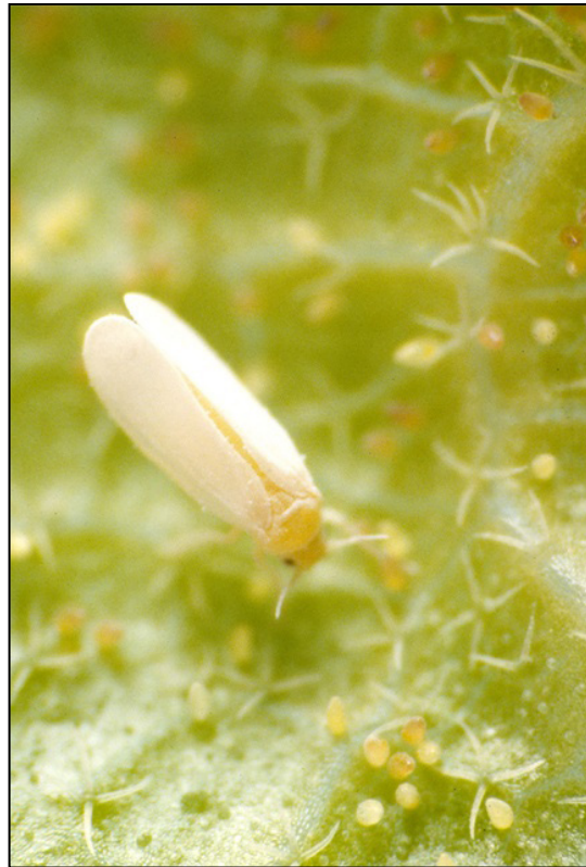
Fig. 3. Silverleaf whitefly adult