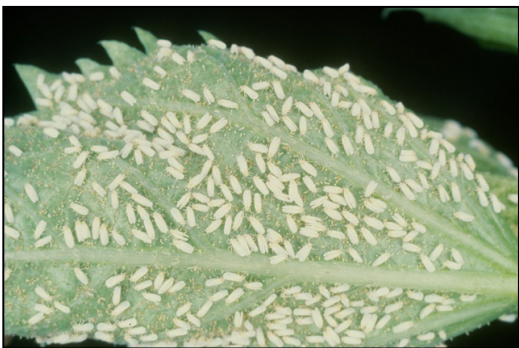
Fig. 2. Infested leaf with silverleaf whitefly adults