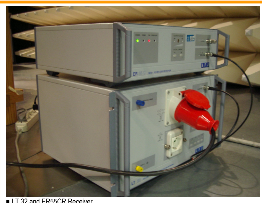
■ LT 32 and ER55CR Receiver

Whenever the EUT dimensions are such that the protective earth conductor is long enough to show a significant impedance, or be close to ¼ of a possible wavelength, or the enclosure has poor conductivity, the test will be performed using the non-fused, built-in artificial protective earth.