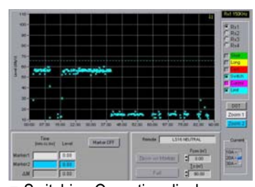
■ Switching Operation display