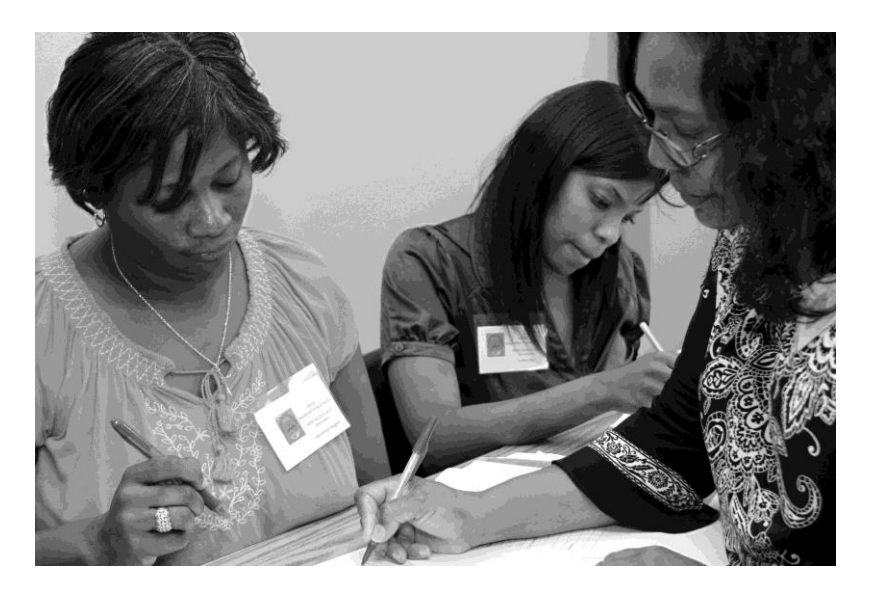
Mission for the Program

The Master of Social Work (MSW) Program at Mississippi Valley State University prepares students for professional social work practice at the micro, mezzo, and macro levels. Through the curriculum, the program instills in students advanced social work knowledge, values, and skills in a manner which enables students to work with diverse populations in a wide range of settings. Concurrently special emphasis is placed on social work practice with impoverished minorities living in rural regions, such as the Mississippi Delta in which the University is located and in the larger, diverse communities elsewhere. Within the framework of rural social work practice, the area of concentration is Child and Family Welfare.