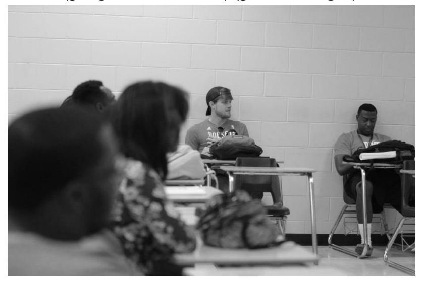
About the Program

The Master of Science in Sport Administration program prepares individuals for leadership in the field of sport administration and management. Students have the option to choose from three concentrations: International Sport, Intercollegiate Sport, and Sport Leadership. It is the overall aim of the Sport Administration program to provide scholars and practitioners quality educational training that will enhance career opportunities in the sporting arena. The three emphases share a common core curriculum of 18 credit hours. Students are also required to take 6 credit hours related specifically to their concentration, a 3 credit hour elective, and a 6 credit hour supervised internship or thesis. The full program requires a total of 33 credit hours.