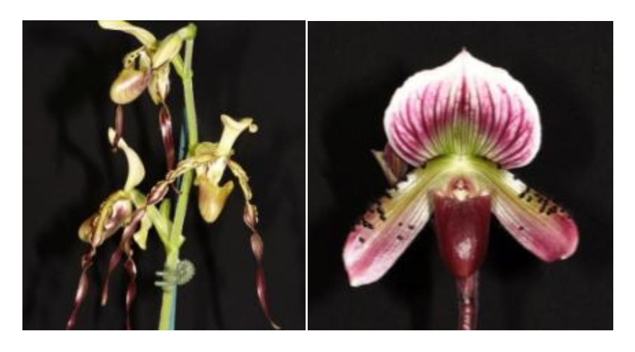
CLASS 17. Brachypetalum Hybrids 1. Paph. Nathaniel's Clarity 2. Paph. Nathaniel's Clarity