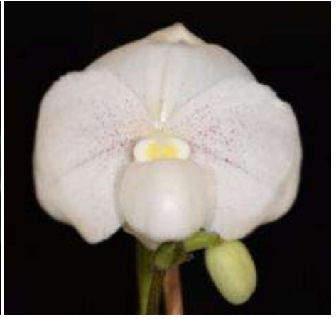
CLASS 5. Parvisepalum Species