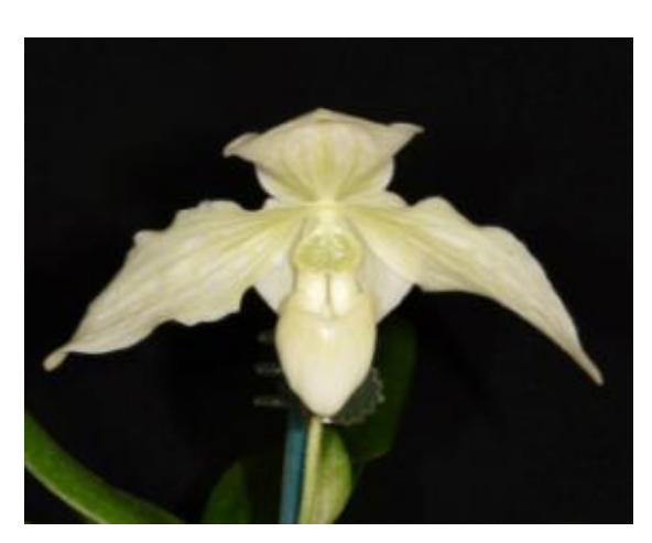
Class 24. Novelty Hybrids – Multi flower or bud 1. Paph. Woluwense 'Yeowie'