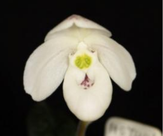
CLASS 9. Other Cypripedioideae Species