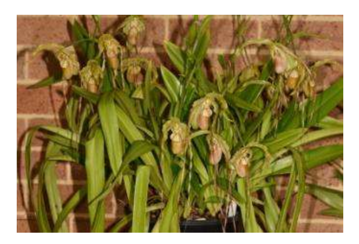
48 plants benched