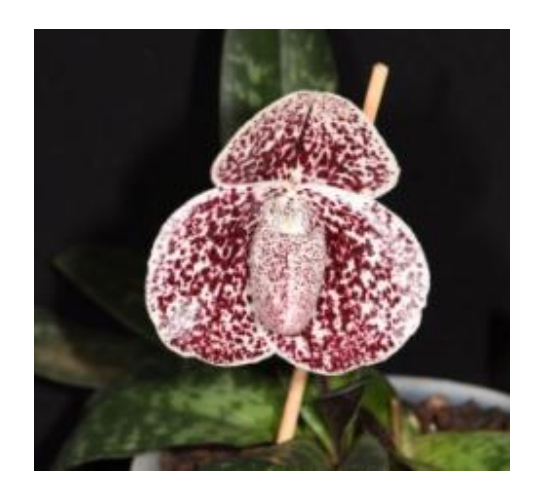
Hybrid of the Evening Paph. Woluwense 'Yeowie'