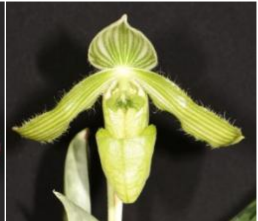
CLASS 8. Paphiopedilum Species - Miniature