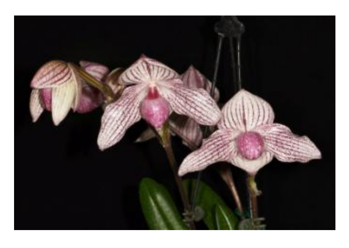
CLASS 26. Other Cypripedioideae Hybrids

1. Phrag . Giganteum 2. Phrag . Geralda 3. Phrag . Praying Mantis