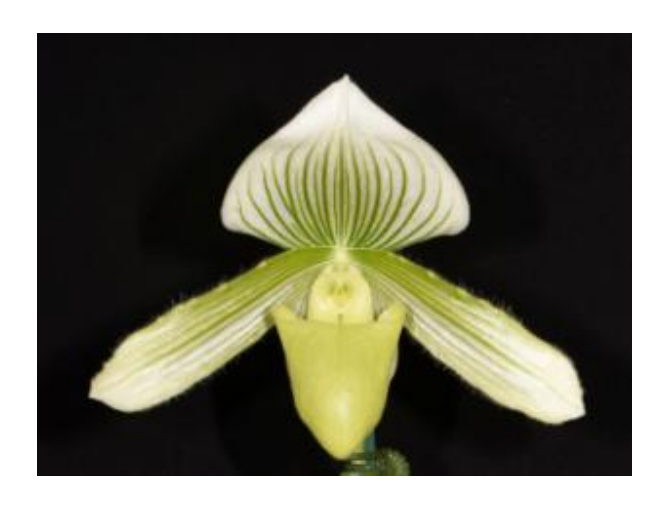
CLASS 22. Maudiae Type Hybrids - vinicolor 1. Paph . Hsinying Book x (Hsinying Cocomaster x Hsinying Rook) Rod Nurthen