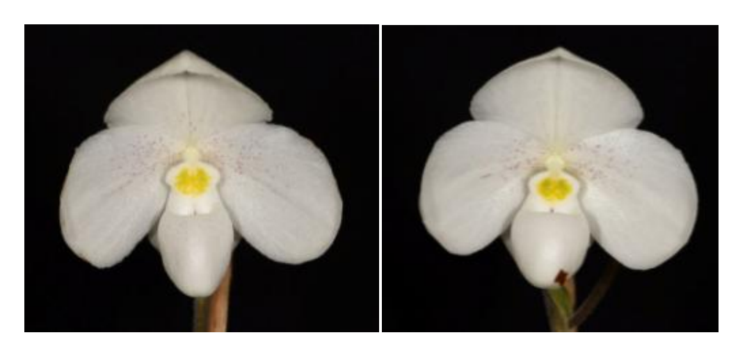
CLASS 18. Parvisepalum Hybrids 1. Paph. Armeni White 2.Paph. Lynleigh Koopowitz 3.Paph. Magic Lantern