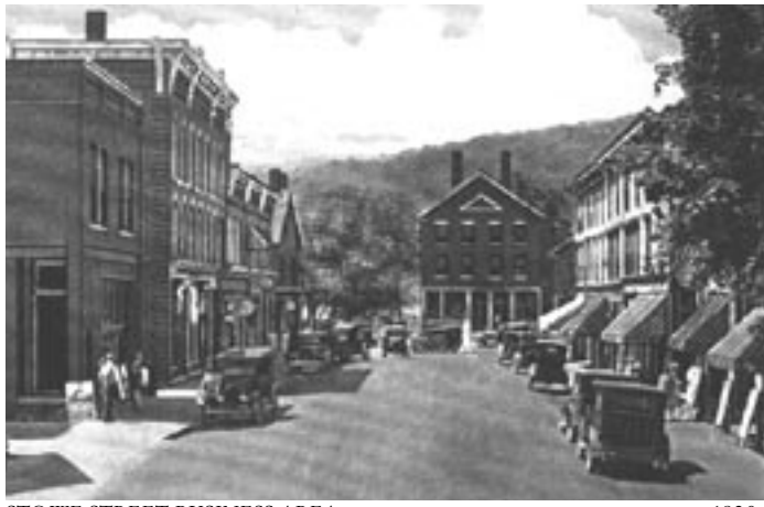
STOWE STREET BUSINESS AREA