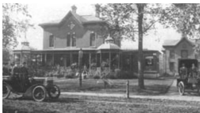
C.C. WARREN HOUSE

Set back from South Main Street, at the head of the horse-shoe drive, sits the original central building of the Vermont State Asylum For The Insane. This section was completed in 1894. Originally, a one-story portico extended over the drive giving access to the entry. Flanking the center entry are two long wings terminating in a two-and-a-half story cylindrical building. Over the years additions to this building and the construction of other buildings produced a nearly self-sufficient entity. Currently only a small portion of this campus is used for a hospital; the remainder contains state offices.