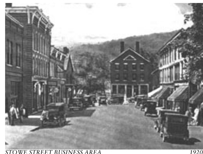
STOWE STREET BUSINESS AREA