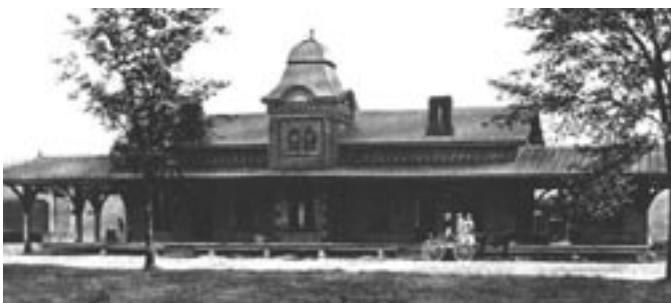
CENTRAL VERMONT RAILROAD STATION

This symbol designates that a granite plaque appears on this building or area. The plaque indicates the original name, date of construction and historic Waterbury logo.