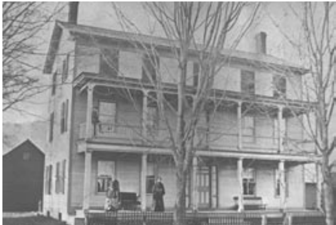
OLD STAGECOACH INN