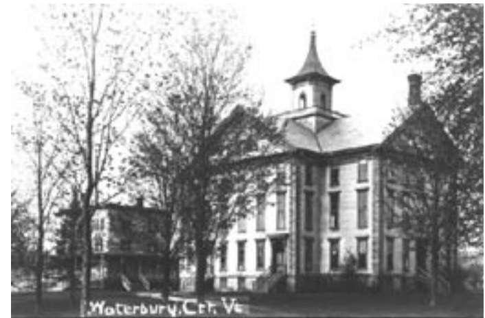
GREEN MOUNTAIN SEMINARY

29 Beyond the green, on Hollow Road, stands the GREEN MOUNTAIN SEMINARY building. It was completed in 1869 as the Free Will Baptist Seminary, with an entering class of "106 gentlemen and 104 young ladies." The two lower floors were used as classrooms with the third and fourth for "gentlemen's rooming." Note the entrances on intersecting wings and on the gable ends of the main structure. A belfry tower and walkway were removed in 1941; the exterior of the building is largely in original condition and was restored and converted to housing in 2001.