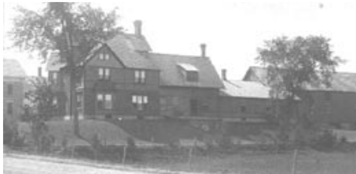
DR. HENRY JANES HOUSE