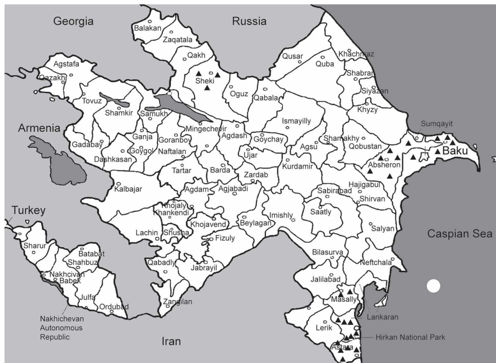
Fig. 1: Map of Azerbaijan: ○ designations; ▲ - material collected area.

Field work was conducted from 1994 to 2004 from April to September in the North (Sheki-Zagatala - 1995), East (Baku-Absheron - 1995-1997, 1999-2000, 2004) and South (Lenkoran - 1994-1997, 2001, 2003-2004; Astara - 1994-1998; Masalli - 1995-1996, 1998) regions of Azerbaijan. Forests, orchards, gardens, and roadsides were investigated within the research areas; Hirkan National Park also was sampled. The paper includes the leaf-rollers found on the host plants (trees and bushes only) in larval or pupal stage. Collected larvae and pupae were kept in the laboratory until imagines hatched. Species determination was done according to these imagines. Species were collected in nature in the larval and pupal stage.