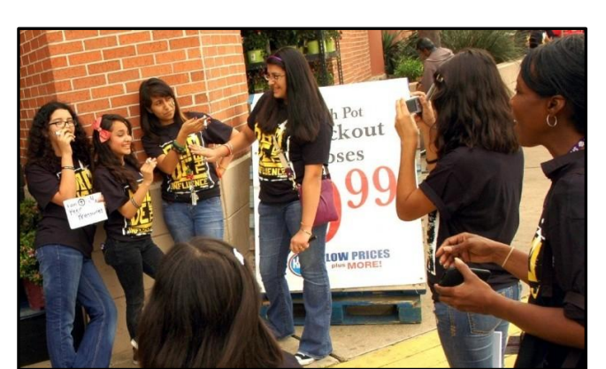
Houston-area teen girls participating in the "Tag it" activity creatively demonstrate how they are "above peer pressure."

Teens from the Coalition of Behavior Health Services conducted a week of "Above the Influence" activities during a local art festival, including the "Tag It" activity, creation of an ATI art mural that traveled to various Houston-area locations, teen panel discussions, and a free concert by a local hip-hop dance group.