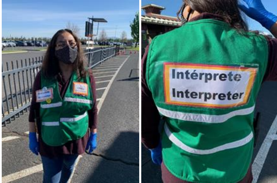
Interpreters are clearly identified with green vests that say “Interpreter” on the front and back (in both English and Spanish).

questions they may have. For example “After I fill out my form, where do I go?” “Will they schedule my second-dose appointment today?” Having not only an interpreter, but also a guide through the vaccination process has helped clients feel more comfortable and well informed. The interpreter also serves as a cultural broker, bridging and mediating between cultural backgrounds and experiences to ensure that the vaccination process is a positive experience for all.