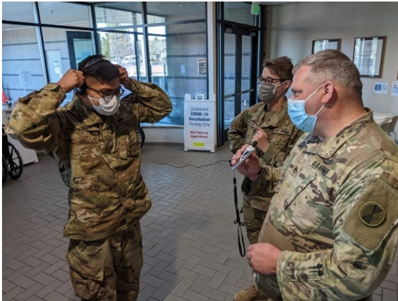
National Guard Staff get trained on how to use Assistive Listening Devices.