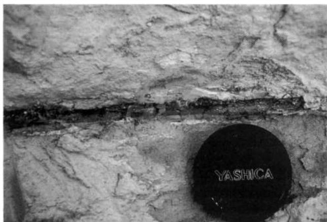
Figure 4. One of the many bentonite seams in the Niobrara Chalk. Volcanic ash from a distant source forms well-defined layers like this within the chalk beds. Bentonities provide evidence for quiet conditions of deposition, as the ash fall is not dispersed, scoured or reworked by currents. These horizons are interpreted in the text as evidence for stationary surfaces within the chalk, with implications for depositional timescales.

of the Niobrara Chalk deposition was at depths greater than the European chalks. Currents were weaker and the bottom of the basin had less oxygen and nutrients to support life. If this conclusion is accepted, the bentonites provide evidence for over 100 stationary surfaces within the Niobrara Chalk which, in turn, is evidence against catastrophic scenarios involving turbulent waters and few cycles of deposition. If Snelling's six-day model 46 for the three units of European Chalk is indefensible in Europe; it is equally deficient in the United States. The evidences, however, are consistent with catastrophic post-Flood chalk formation over a period measured in decades.