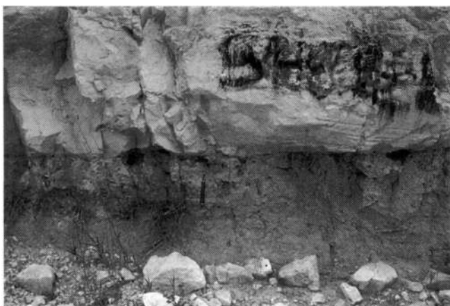
Figure 2. The Niobrara Chalk overlying the Codell Sandstone Member of the Carlile Shale. The geological hammer marks the sharp boundary. This site, like so many others, has been marred by a graffiti artist. As in England, 'low-energy' chalk is separated from the 'high-energy' sandstone by an erosive horizon. Uniformitarian models of deposition do not do justice to the observations.