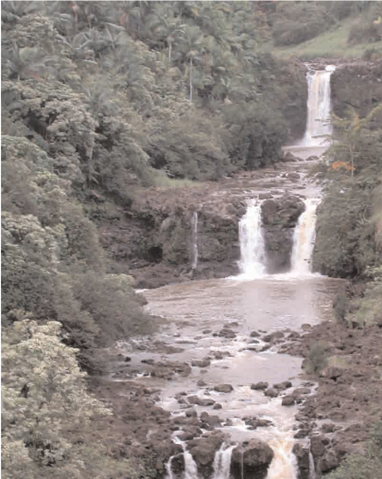
Figure 1. Midreach of Umauma Stream, Island of Hawai'i, demonstrating an example of "Aa" topography.

either into the ocean or onto a narrow rocky beach (Fig. 2). On the relatively older islands such as O'ahu and Kaua'i, larger stream systems are more common than they are on the younger islands. Long, low gradient terminal reaches exist upstream of sinuous mixohaline estuaries (Nishimoto & Kuamo'o 1991), above which can exist long midreach areas dominated by Type Bc and Type Bb reaches which grade into type Ab reaches farther inland. Type Aa reaches are encountered in these "terminal estuary streams" in upper midreach and headwater areas which can be several kilometers inland from the mouth of the stream (Fig. 3).