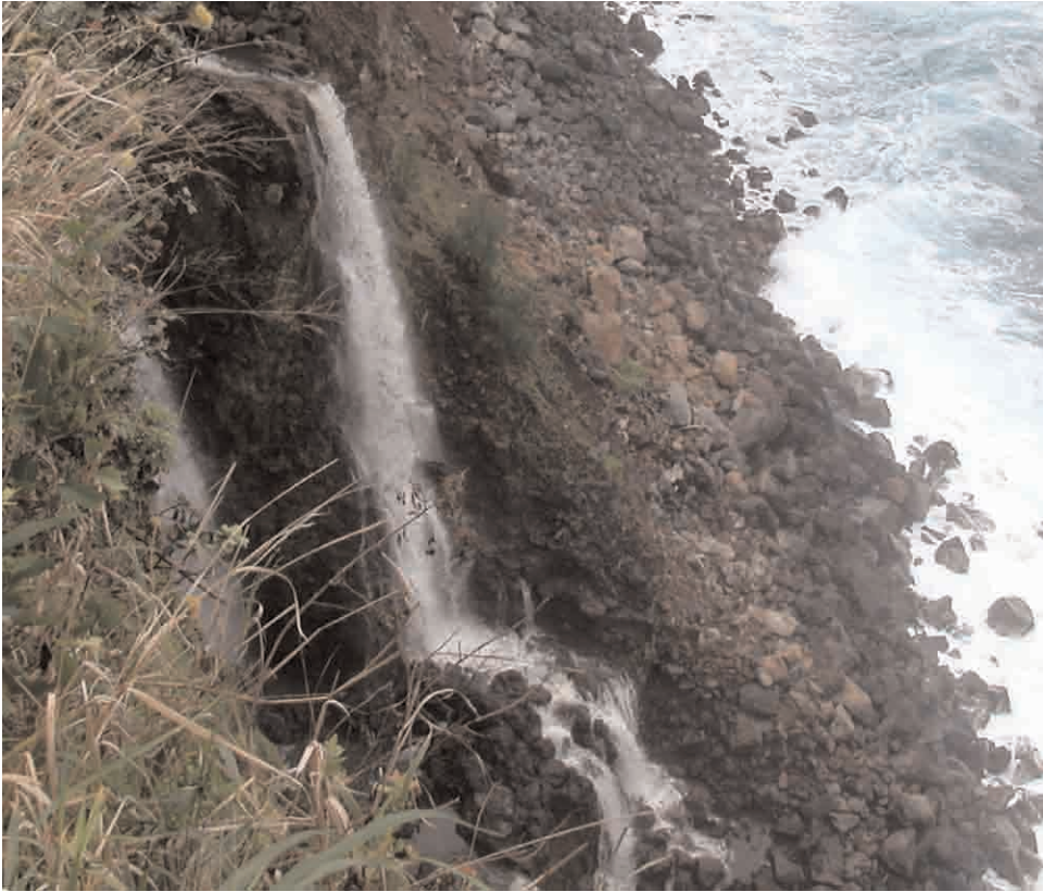
Figure 2. Terminal waterfall at the mouth of Manoloa Stream on the Island of Hawai'i.

faces associated with waterfalls when they are post-larvae and juveniles by using pelvic fins which are fused to form a suction disk. Eleotris sandwicensis lacks fused pelvic fins while S. hawaiiensis has fused pelvic fins, but lacks the associated musculature necessary for climbing waterfalls (Nishimoto & Kuamo'o, 1997). Both species, therefore, are precluded from dispersing upstream of any precipitous waterfall and are restricted in their distributions to terminal reaches and terminal estuaries. Awaous guamensis and S. stimpsoni can climb and disperse beyond moderately high waterfalls (less than ~20 m) and are found in Type Bc, Bb, and Aa midreaches up to an elevation of approximately 150 m (Fitzsimons & Nishimoto, 1990). Vertical waterfall height does not appear to be a limiting factor for L. concolor as they migrate upstream. Lentipes concolor has been sighted at elevations higher than 1 km (Fitzsimons & Nishimoto, 1990) and in stream reaches that were located above a waterfall with a more than 300 m vertical height (Englund & Filbert, 1997; personal observation).