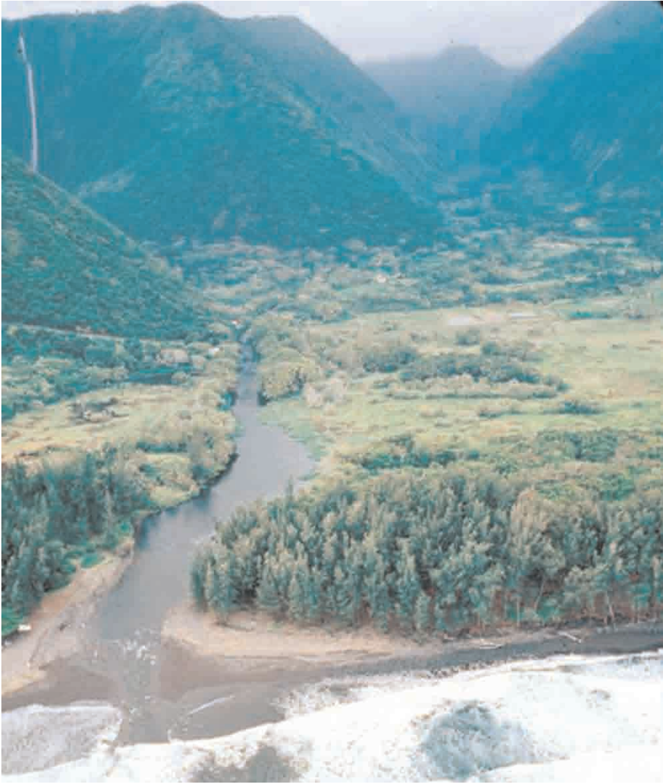
Figure 3. Example of a terminal estuary stream. Wailoa Stream, Waipi'o Valley, Island of Hawai'i.

(Nishimoto & Kuamo'o, 1991; Kinzie, 1988; Kido et al. , 2002). Similar waterfall-delineated in-stream distribution patterns have been described for assemblages of amphidromous gobies in Micronesia (Parham, 1995; Nelson et al. , 1997).