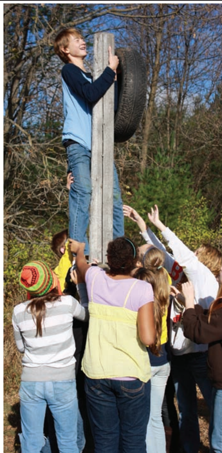
Impact 365 guiding youth from Braham Lutheran at the Luther Point Challenge Course.