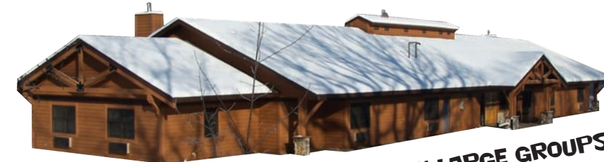
WITH LARGE GROUPS!