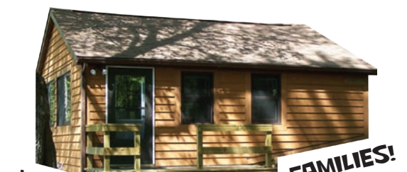
WITH SMALL GROUPS OR FAMILIES!

EXPLORE YOUR OPTIONS ONLINE OR GIVE US A CALL!