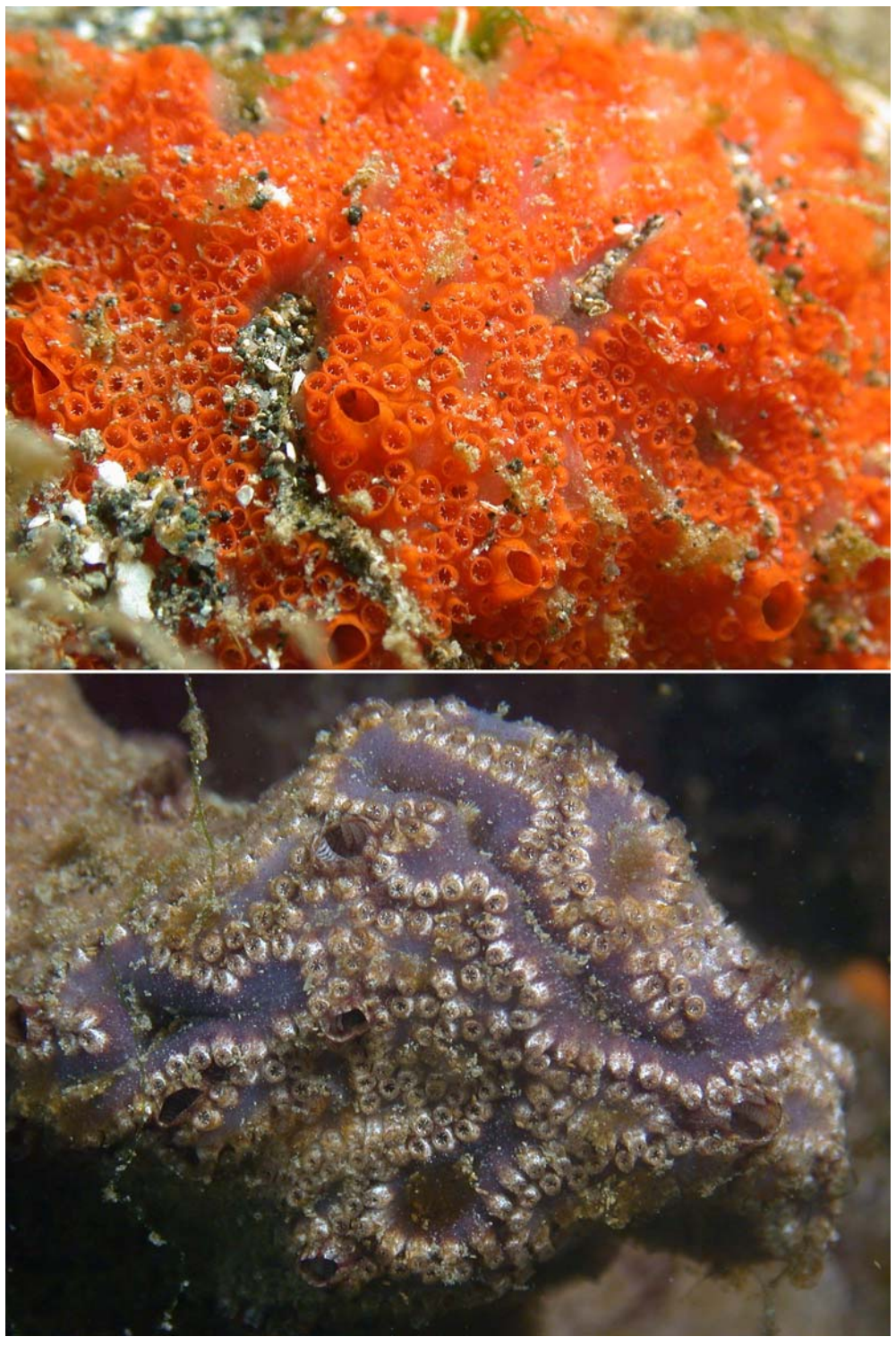
Fig. 3. Botrylloides perspicuum Herdman, 1886.