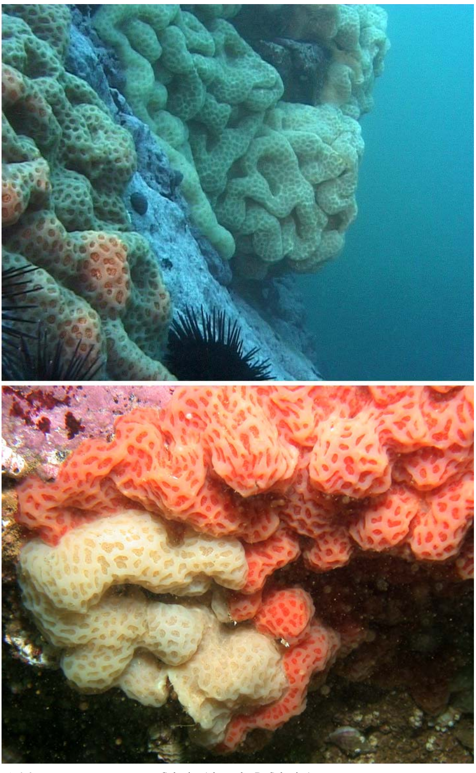
Figs 1, 2. Aplidium peruvianum, spec. nov. Colonies.