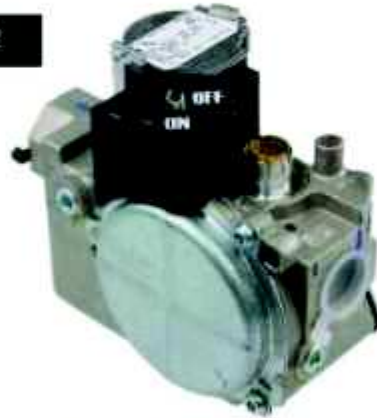
White Rodgers valve