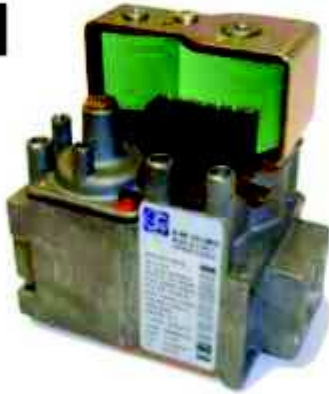
SIT 830 tandem valve