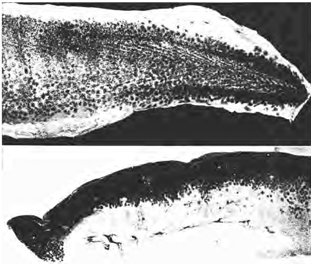
Figure 3. Enlargements of the head and tail regions of an ammocoete of Entosphenus hubbsi , new species, 160 mm.

number of tentacles was 9-15 (mean 12.5). In one specimen of E. lethophagus , and one of E. minimus , we counted only seven tentacles; however, in E. minimus the range is 5-7 according to Bond ( pers. comm. ). In three specimens of E. hubbsi , we found only three tentacles in each.