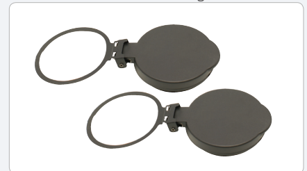
ARF Filter Caps