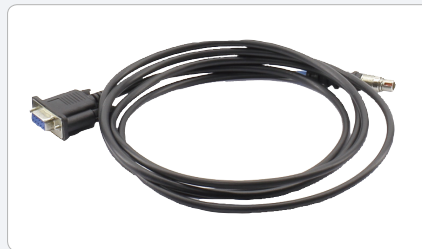
LRF GPS Cable