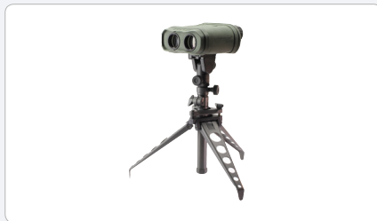
NC SST3-3S Tripod