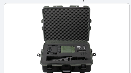
Hard Case with Optional Accessories