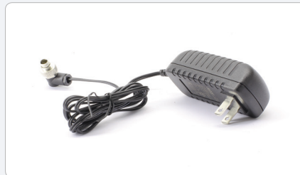
LRF AC/DC Adapter