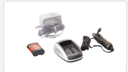
LRB 6/12K Rechargeable Kit