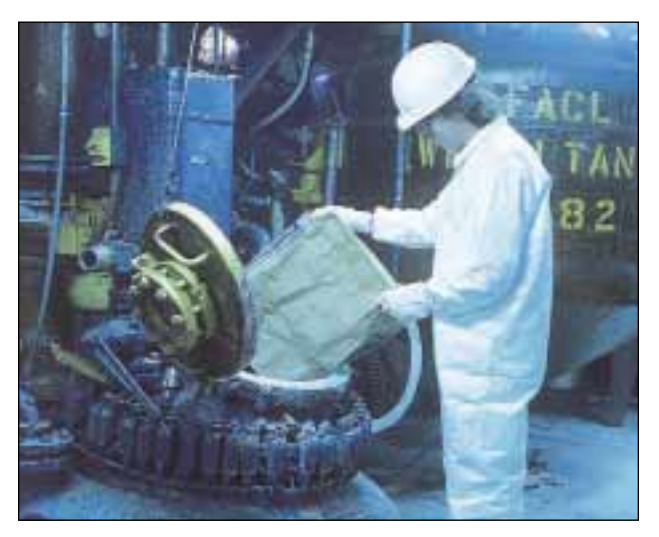
The versatility of the FB 350 Series Digital Indicator makes it an instrument of choice for a variety of applications and environments, including harsh, chemical operations.