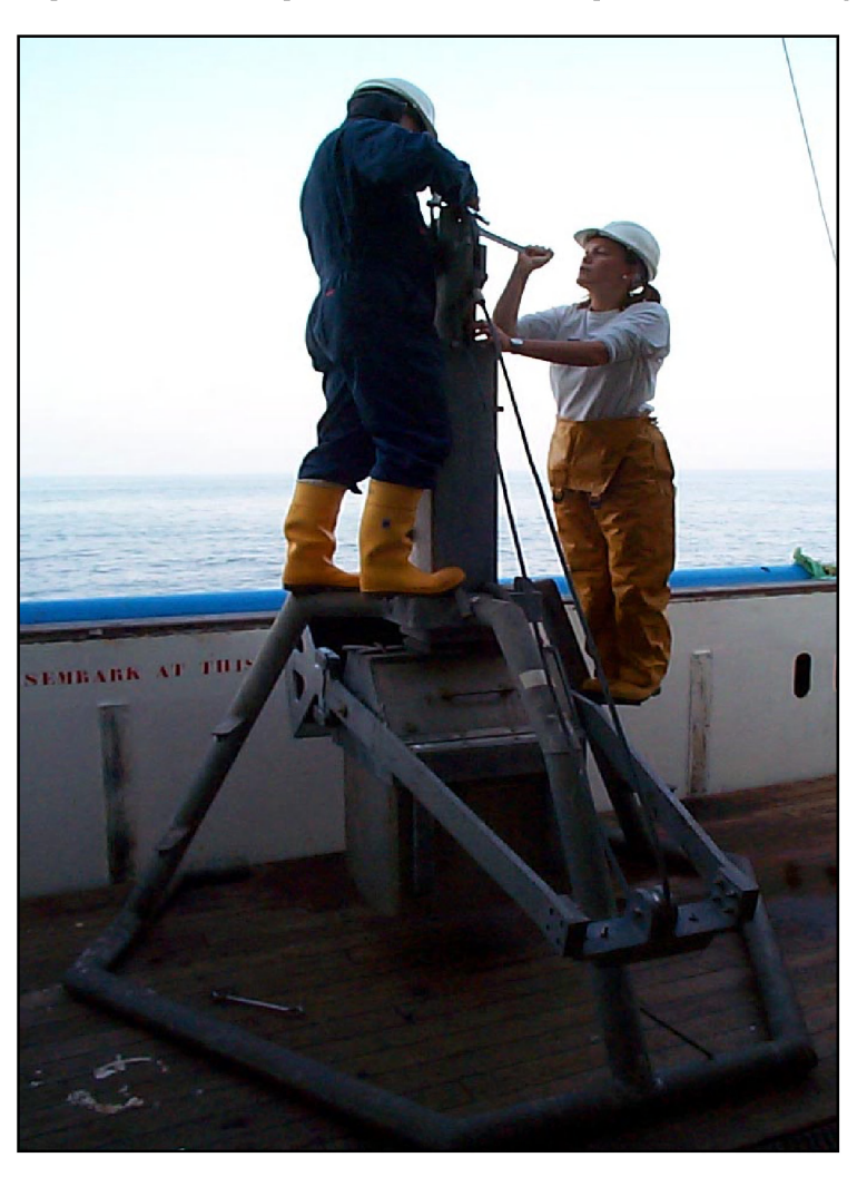
Figure 4. Box corer of FRS Marine Laboratory