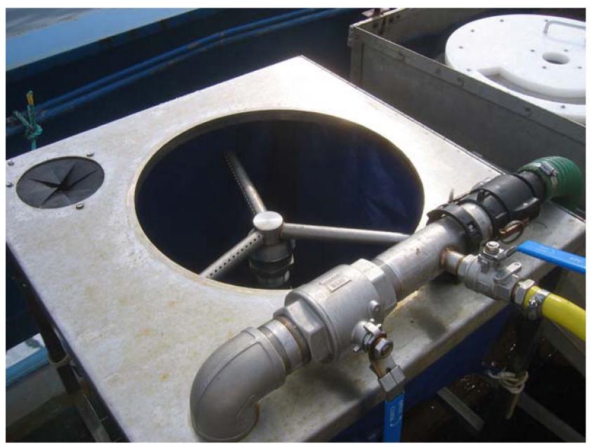
Figure 5. Gardline Autosiever