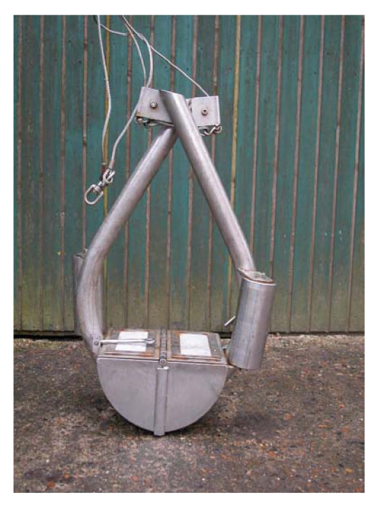
Figure 3. Van Veen grab of the Senckenberg Institute, Germany