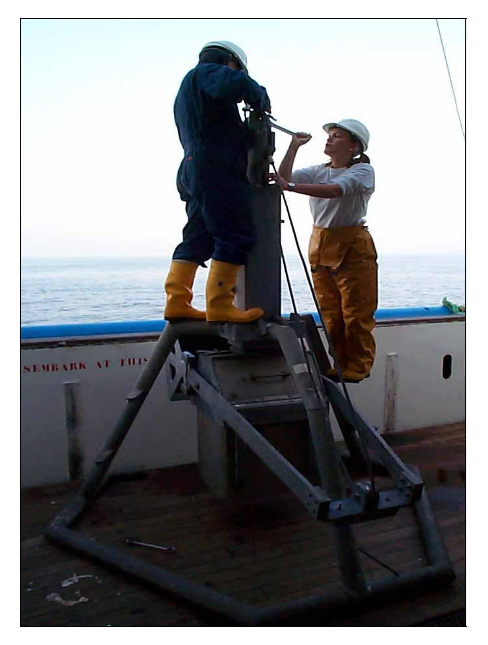
Figure 6.5.21.1. Box corer of FRS Marine Laboratory

section 6.14.5). Penetration depth must be measured using a ruler in the centre of the box. This need to be of sufficient length to be capable of measuring penetration depth when the box core has fully penetrated the sediment. The sampled material will be passed through a sieve stack consisting of sieves with mesh sizes of 4mm, and 1mm. Because of the quantity of material involve, particularly if a 0.25m<sup>2</sup> box core is used, this process is impractical without using a Gardline Autosiever (Figure 6.5.1.1.2). Material retained in each sieve will be stored in buffered 4% formaldehyde solution, so storage bottles/containers and waterproof labels for all sieve fractions will be required. All samples should be stored in containers labeled internally and externally. Finally a corer for collecting sediment samples (25-mm diameter cores to 10cm depth) from the material in the box core will be required.