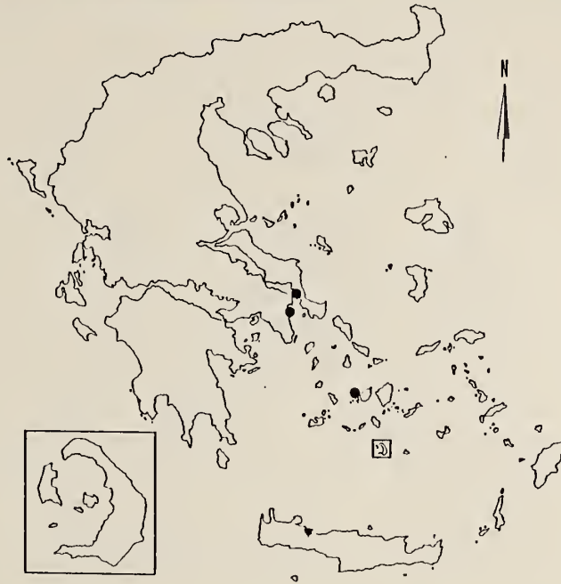
Map 4. Leptochiton bedullii Dell'Angelo & Palazzi, 1986. Black circles indicate localities studied by the author; triangles are literature records.