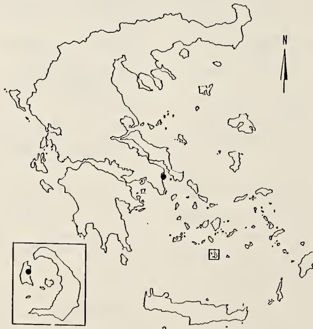
Map 3. Leptochiton scabridus (Jeffreys, 1880). Black circles indicate localities studied by the author.