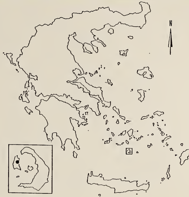
Map 8. Lepidochitona monterosatoi Kaas & Van Belle, 1981. Black circles indicate localities studied by the author.