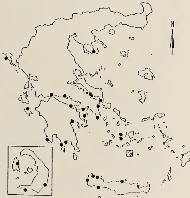
Map 9. Ischnochiton rissoi (Payraudeau, 1826). Black circles indicate localities studied by the author; triangles are literature records.