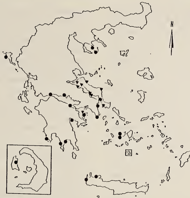
Map 12. Acanthochitona fascicularis (Linnaeus, 1767). Black circles indicate localities studied by the author; triangles are literature records.