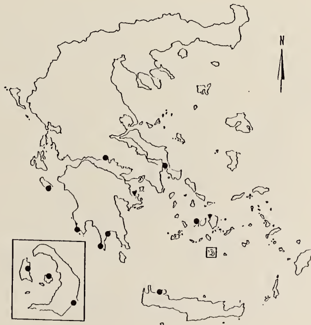
Map 5. Callochiton septemvalvis euplaeae (O.G.Costa, 1829). Black circles indicate localities studied by the author; triangles are literature records.