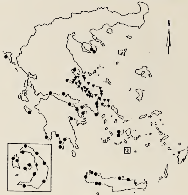
Map 10. Chiton (Rhyssoplax) olivaceus Spengler, 1797. Black circles indicate localities studied by the author; open circles are literature records.