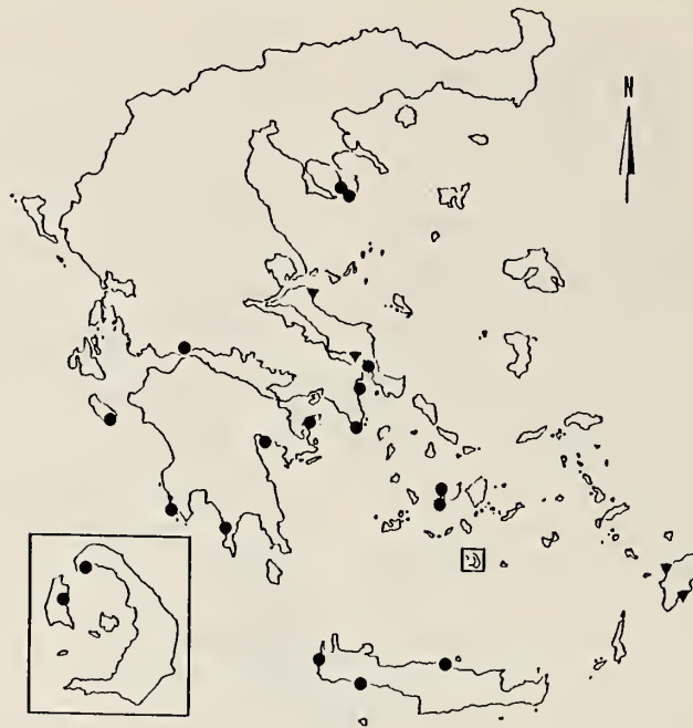
Map 2. Lepidopleurus cajetanus (Poli, 1791). Black circles indicate localities studied by the author; triangles are literature records.