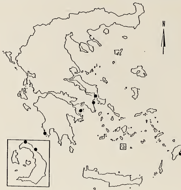
Map 6. Lepidochitona cinerea (Linnaeus, 1767). Black circles indicate localities studied by the author; triangles are literature records.