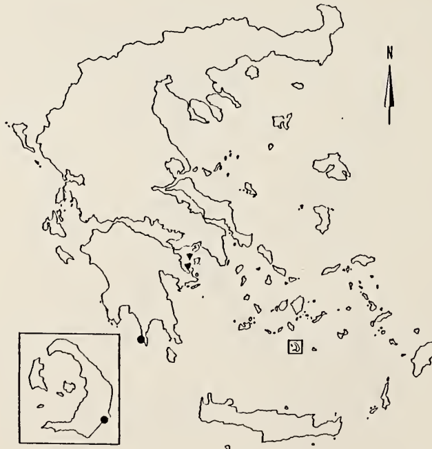
Map 11. Chiton (Rhyssoplax) corallinus (Risso, 1826). Black circles indicate localities studied by the author; triangles are literature records.