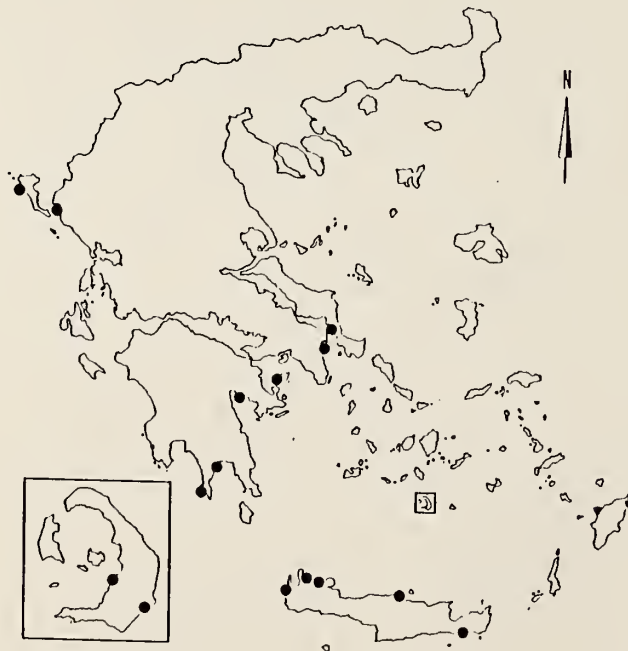
Map 7. Lepidochitona corrugata (Reeve, 1848). Black circles indicate localities studied by the author; triangles are literature records.