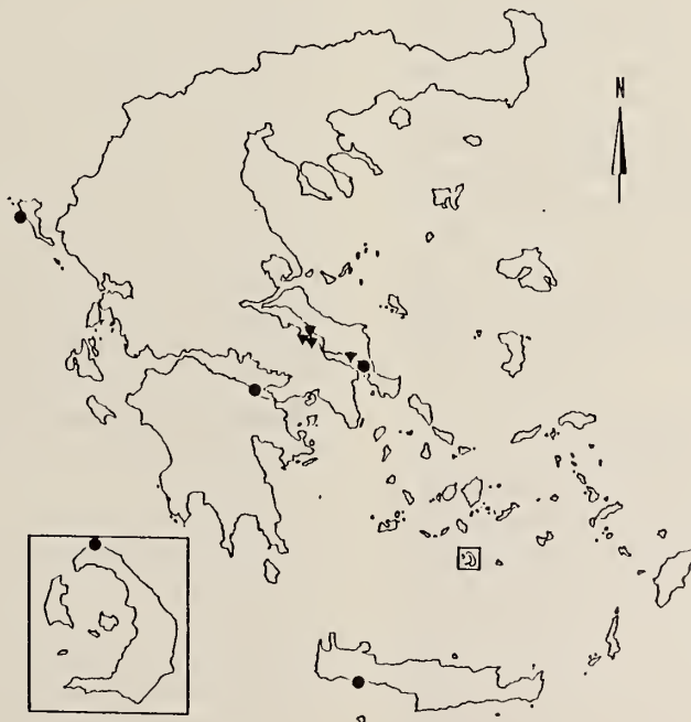
Map 13. Acanthochitona crinita (Pennant, 1777). Black circles indicate localities studied by the author; triangles are literature records.