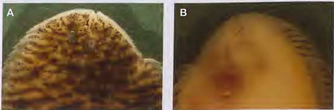
FIG. 4. Holotype of Synclidopus hogani sp. nov., QM I.38104, 61.6mm SL. A, Dorsal view of head, showing robust papillae; B, Ventral view of head, showing numerous papillae and fleshy sheath covering anterior part of lower jaw.

conductivity 59.6-60.6 \mu\text{S}/\text{cm} (approximately 30 ppm), pH 6.8, temperature 29°C, dissolved oxygen 6.5 ppm, and turbidity 0.8 NTU. Salinity at the type locality was similarly low when paratype QM I.36402 was collected in June, 2002 (conductivity was 75 \mu\text{S}/\text{cm} , or 37.5 ppm). Other fishes recorded within about 300m of the type locality on 28 November 2006 included Anguilla reinhardtii , Megalops cyprinoides , Nematalosa erebi , Chanos chanos , Neosilurus ater , Arrhamphus sclerolepis , Melanotaenia splendida splendida , Pseudomugil signifer , Notesithes robusta , Lates calcarifer , Ambassis agassizii , Ambassis miops , Hephaestus fuliginosus , Mesopristes argenteus , Glossamia aprion , Caranx sexfasciatus , Leiognathus equulus , Lutjanus argentimaculatus , Gerris filamentosus , Acanthopagrus australis , Toxotes chatareus , Mugil cephalus , Awaous acritosus , Glossogobius sp. 1 (of Allen et al., 2002: 269), Redigobius bikolanus , Giuris margaritacea and