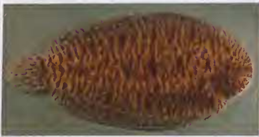
FIG. 3. Holotype of Synclidopus hogani sp. nov., QM I.38104, 61.6mm SL, preserved.

leaves and the open shells of freshwater bivalve molluscs. The riverine environment at the type locality is flowing, clear and fresh (being about five or six kilometres upstream from the brackish zone), but is clearly subject to tidal influence, with about a 75cm rise and fall. Physical data taken with the holotype on 28 November 2006 included: