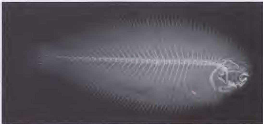
FIG. 1. Radiograph image of holotype of Synclidopus hogani sp. nov., QM I.38104, 61.6mm SL.

or uniform colouration in Aseraggodes ). A combination of three branches of the lateral line on the ocular side of the head (the dorsal branch being long and vertical), small eyes, high number of lateral-line scales, scales on blind side of head anterior to jaws replaced by cirri, pelvic-fin rays 5 (3-4, rarely 5 in Leptachirus , 4-5 in Pardachirus ); ocular-side pelvic fin broadly attached to the first anal ray (not attached in Leptachirus or Pardachirus , except in P. poropterus ), absence of prominent pores at the base of the rays of the median fins (pores present in Pardachirus ), 7 dorsal pterygiophores anterior to the fourth neural spine (7-16, only one with 7 or 8, in Aseraggodes , 7-11 in Leptachirus , 10-18 in Pardachirus ), and banded colour pattern are also useful in separating it from Aseraggodes , Leptachirus and Pardachirus (Randall, 2005, 2007; Randall & Johnson, 2007; Randall & Desoutter-Meniger, 2007). Species of Synclidopus are found in shallow freshwater, estuarine, or inshore marine habitats, whereas species of Aseraggodes are found only in marine habitats, in various depths from shallows to over 100m. Leptachirus species are found in freshwater or upper estuarine conditions (Randall, 2007). Most Pardachirus species are marine, except the estuarine P. rautheri and estuarine/lower freshwater P. poropterus (Randall & Johnson, 2007).