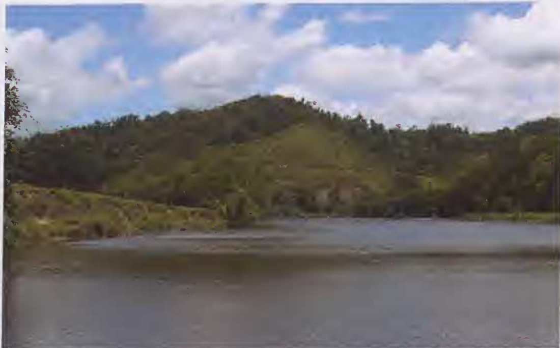
FIG. 6. Daintree River, looking downstream to type locality of Synclidopus hogani .

white appearance, bitter taste, and lethal effect on small fishes if they are confined with it in a small body of water. Experiments to determine whether S. hogani had this capacity were conducted in the field shortly after collection of the type specimens. All were landed alive and well, and to minimise stress they were retained in a large, shaded and well-aerated container before the tests. Attempts were made to induce production of the toxin by gently and repeatedly massaging the body and median fins of two specimens, however, no milky exudate was visibly evident, and clear mucus from the body and fins had no bitter taste. These fish were then immediately introduced to a vessel containing about one litre of water, eight small empire gudgeons ( Hypseleotris compressa ), and four small Pacific blue-eyes ( Pseudomugil signifer ). After one hour all fish were healthy and showing no signs of stress. In case electric shock from the electrofishing gear had caused the S. hogani to discharge and exhaust their reserves of toxin, we repeated the process after two days, but the same results were obtained. We therefore conclude that S. hogani produces no significant amounts of toxin externally through the skin or pores, or at least none of a similar nature to that reported for Pardachirus or some Aseraggodes species.