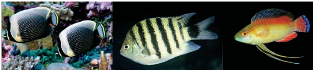
Plate 3.17. New distributional records included (from left to right): Chaetodon reticulatus , Abudefduf lorentzi , and Cirrhilabrus pylei .