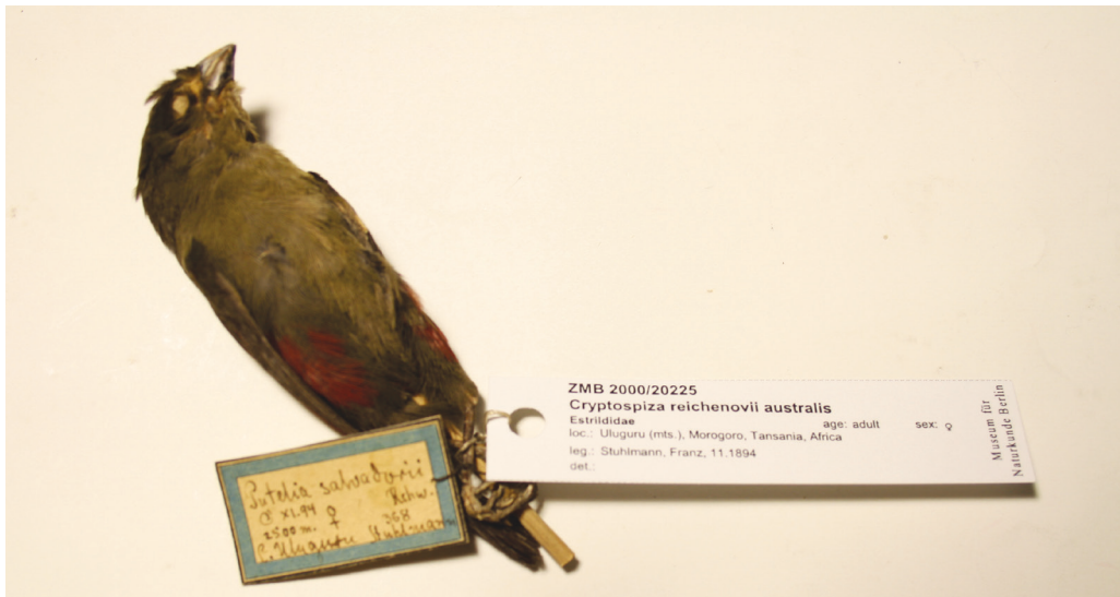
Figure 2. The female Cryptospiza specimen collected by F. Stuhlmann in October 1894 at 2,500 m in the Uluguru Mountains, Tanzania, initially identified as Abyssinian Crimsonwing C. salvadorii (presumably by A. Reichenow) and now correctly identified as Red-faced Crimsonwing C. reichenovii australis , Museum für Naturkunde, Berlin

Birds of Africa (Keith 2004) reported the ranges of wing and tail measurements, respectively, for females of C. salvadorii kilimensis (wing 56–58 mm, mean = 57.0 mm; tail 40–44 mm, mean = 41.9 mm) and C. r. reichenovii (wing 52–57 mm, mean = 53.9 mm; tail 36–41 mm, mean = 39.4 mm). As such data were not provided for C. r. australis , the race in the Eastern Arc Mountains to Malawi and Mozambique (Britton 1980, Keith 2004), we measured seven females of C. r. australis from Malawi, Mozambique and the Uluguru Mountains from the FMNH series. One Uluguru adult female (MCZ 134084) measured 54 and 39 mm for wing and tail, whereas the juvenile female (MCZ 134085) correspondingly measured 50 and 41 mm, respectively. Wing and tail measurements of C. r. australis were 52–56 (mean = 54.9) and 36–40 (mean = 39.2) mm, respectively. Comparing these measurements places the adult MCZ specimen within the range of C. reichenovii rather than C. salvadorii .