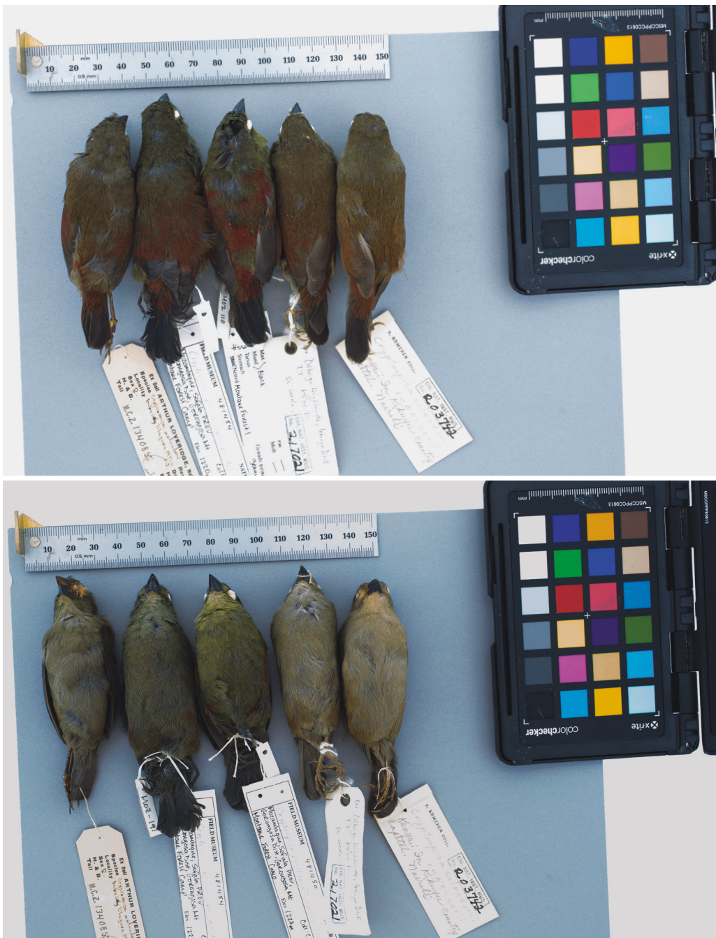
Figure 4. Comparative dorsal (top) and ventral (bottom) views of juvenile / immature specimens of Red-faced Crimsonwing Cryptospiza reichenovii australis and Abyssinian Crimsonwing C. salvadorii of both sexes, including the Loveridge specimen from the Uluguru Mountains described in Friedmann & Loveridge (1937). Specimens (left to right) as follows: C. r. australis (female, 'Mbeta' = Mgeta, Uluguru Mountains, Tanzania, leg. A. Loveridge, 24 July 1922, MCZ 134085); C. r. australis (male, Mt. Gorongosa, Mozambique, leg. S. Reddy, 20 August 2011, FMNH 481454); C. r. australis (female, Mt. Gorongosa, Mozambique, leg. C. Salema, 15 August 2011, FMNH 481450); C. r. australis (male, Dabaga Highlands, Iringa, Tanzania, leg. J. G. Williams, 26 March 1952, FMNH 217021); C. salvadorii ruwenzori (female, Nairobi, Kikuyu, Kenya, leg. V. G. L. van Someren, 24 May 1918, FMNH 203742) (N. J. Cordeiro)