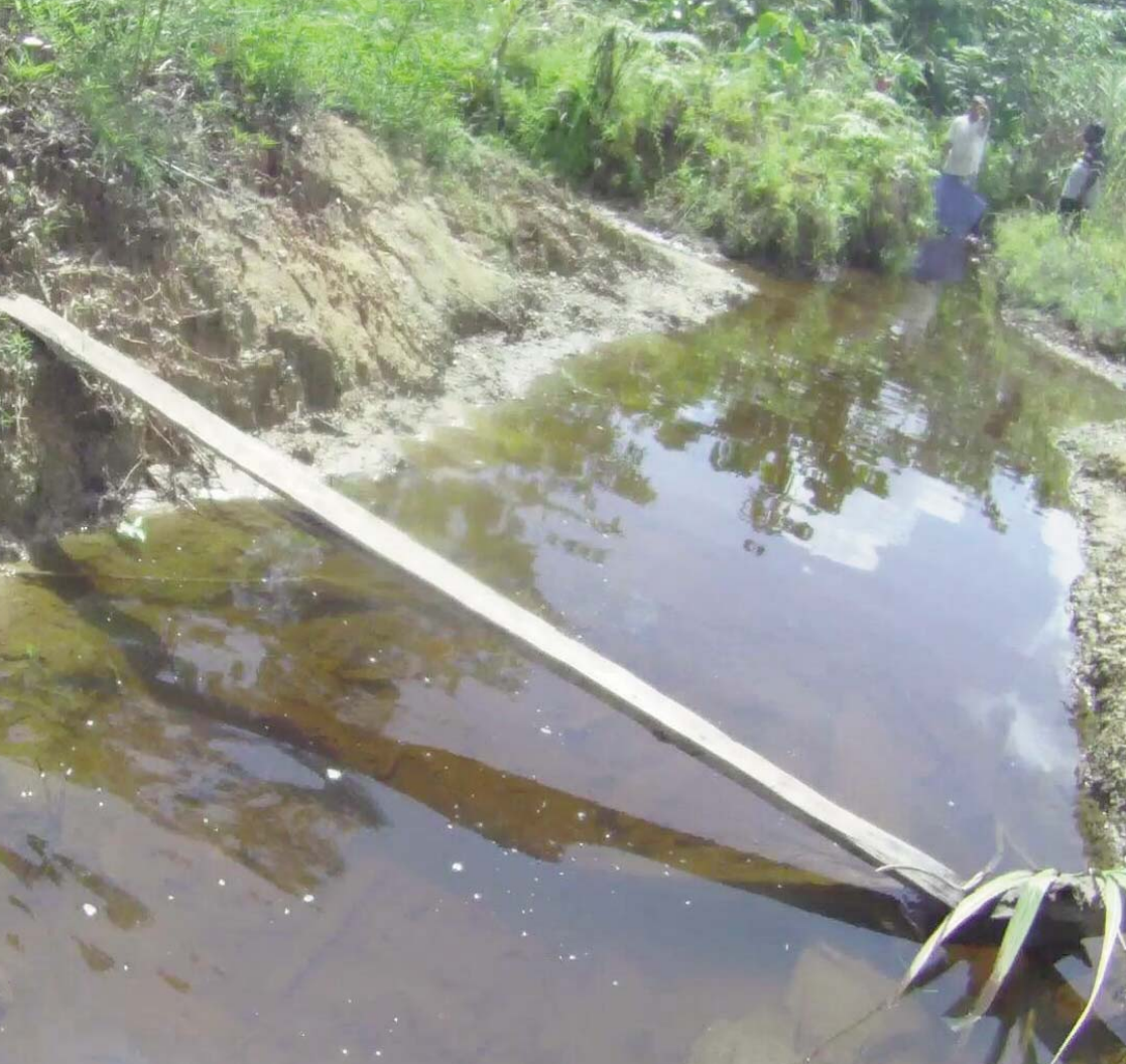
Fig. 6. Type locality of Melanotaenia garylangei , new species, in the vicinity of Dekai village, Brazza River in the Eilanden River system, West Papua Province, Indonesia). G.L.

the stream edges. Melanotaenia garylangei apparently prefers shallow (10–20 cm depth) areas frequently covered with floating grass, as opposed to Pseudomugil sp., which was recorded predominantly in very shallow (5–10 cm depth) water.