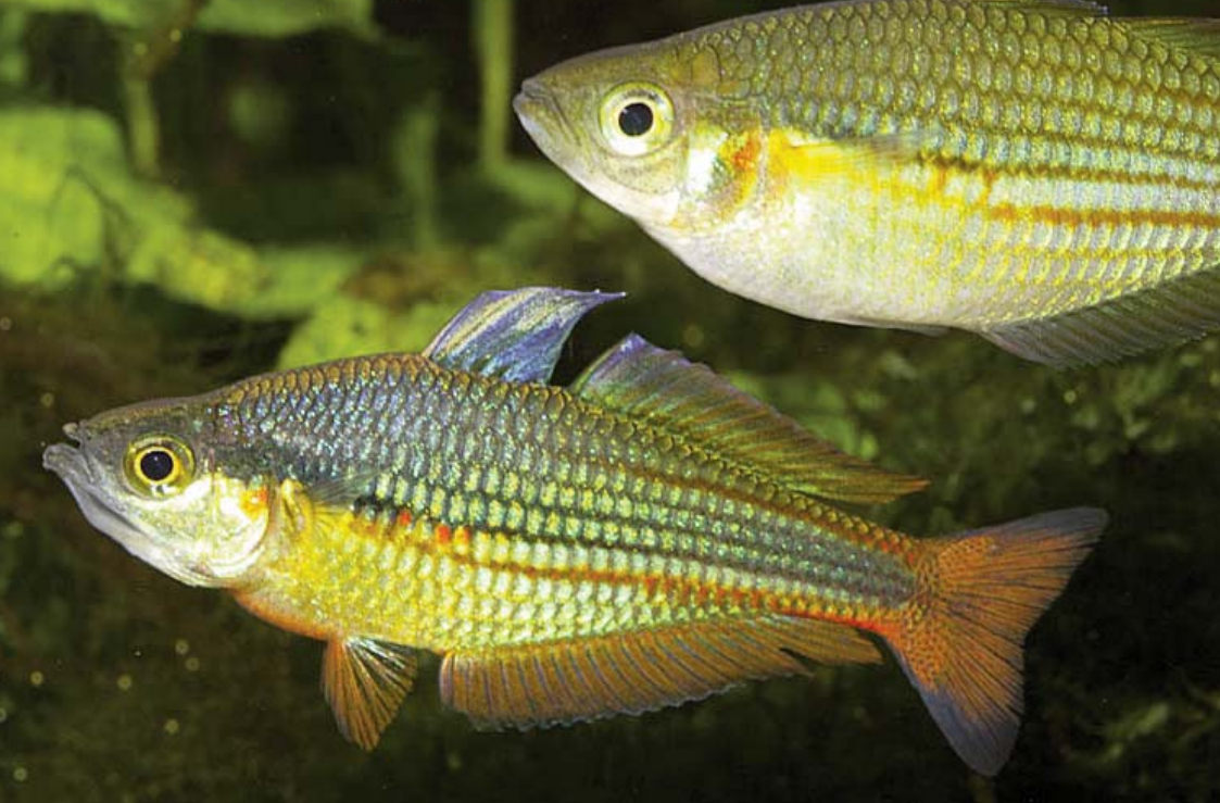
Fig. 3. Melanotaenia garylangei , new species, captive specimens: male (lower left fish) showing courtship display to female (upper right fish). G.L.

Sexual dimorphism. Sexual maturity is reached at a size of approx. 25 mm SL and 6 months of age, based on aquarium observations. Males develop a deeper body than females, and have moderately elongated and pointed unpaired fins, compared with short and rounded in females. Colour of the unpaired fins in males red, fading to yellowish orange towards the body, those of females translucent with faint dark margin. In males, the tip of the first dorsal fin is coloured whitish blue and extends posteriorly past the origin of the second dorsal fin, which is not the case in females. Depth of the body in adult males (over 50 mm SL) ranges from 32–37% of SL, and for females from 30–33% of SL. Males below 50 mm SL show the same proportions as females. Data are shown in Table 3. Males develop elongated dorsal and anal fins from approx. 25 mm SL, based on aquarium observations.