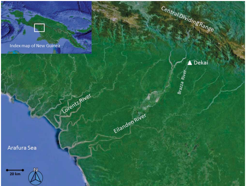
Fig. 1. Map of the Sungai Unir (Eilanden River) system. The type locality of Melanotaenia garylangei , new species, is denoted by a triangle.

et al 2014; M. fasinensis Kadarusman et al. 2010; M. flavipinnis Allen et al. 2014; M. laticlavia Allen et al. 2014; M. mairasi Allen & Hadiaty 2011; M. multiradiata Allen et al. 2014; M. rubrivittata Allen et al. 2015; M. salawati Kadarusman et al. 2011; M. sneideri Allen & Hadiaty 2013; M. urisa Kadarusman et al. 2012b; M. veoliae Kadarusman et al. 2012b and M. wanoma Kadarusman et al. 2012b. Several other species are known, but remain undescribed (Unmack et al. 2013; GR Allen, pers. comm. 2014).