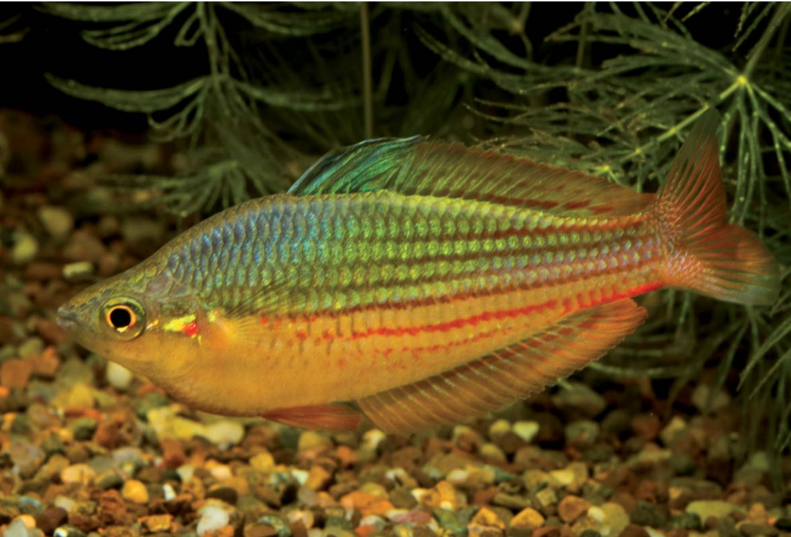
A new species of rainbowfish, Melanotaenia garylangei .

JOURNAL OF THE AUSTRALIA NEW GUINEA FISHES ASSOCIATION incorporated Registration No. ACO27788J