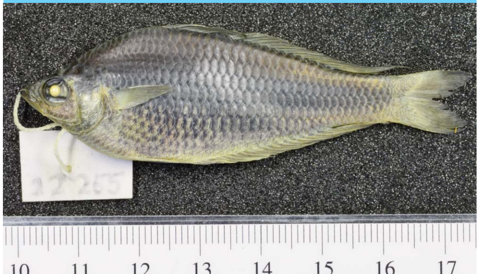
Fig. 5. Melanotaenia garylangei , new species, photograph of MZB 22255, the male holotype after 24 months in 70% ethanol.

Fish species co-occurring with Melanotaenia garylangei include Melanotaenia goldiei , Melanotaenia rubrostriata , Pseudomugil sp., and Ambassis agrammus . All three Melanotaenia species recorded in this area occur in close proximity; in some cases all the species mentioned above were present in the same net haul. However, it appears that M. goldiei predominantly lives in faster flowing, open water, whereas M. rubrostriata is found closer to