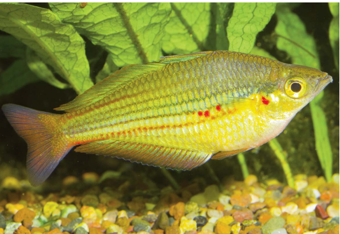
Fig. 4. Melanotaenia garylangei , new species, male captive specimen.

Genetic analyses based on seven mitochondrial genes and the first two introns of the nuclear S7 gene of nearly all described species of rainbowfishes and several undescribed populations (Unmack, et al. 2013), showed a clear distinction between Melanotaenia garylangei (listed in Unmack et al. 2013 as M. sp. Dekai ) and the other members of the “Maccullochi” group. Based on that study, M. sylvatica and M. sp. NT ( M. maccullochi “Burton Creek”) are the closest relatives to the new species.