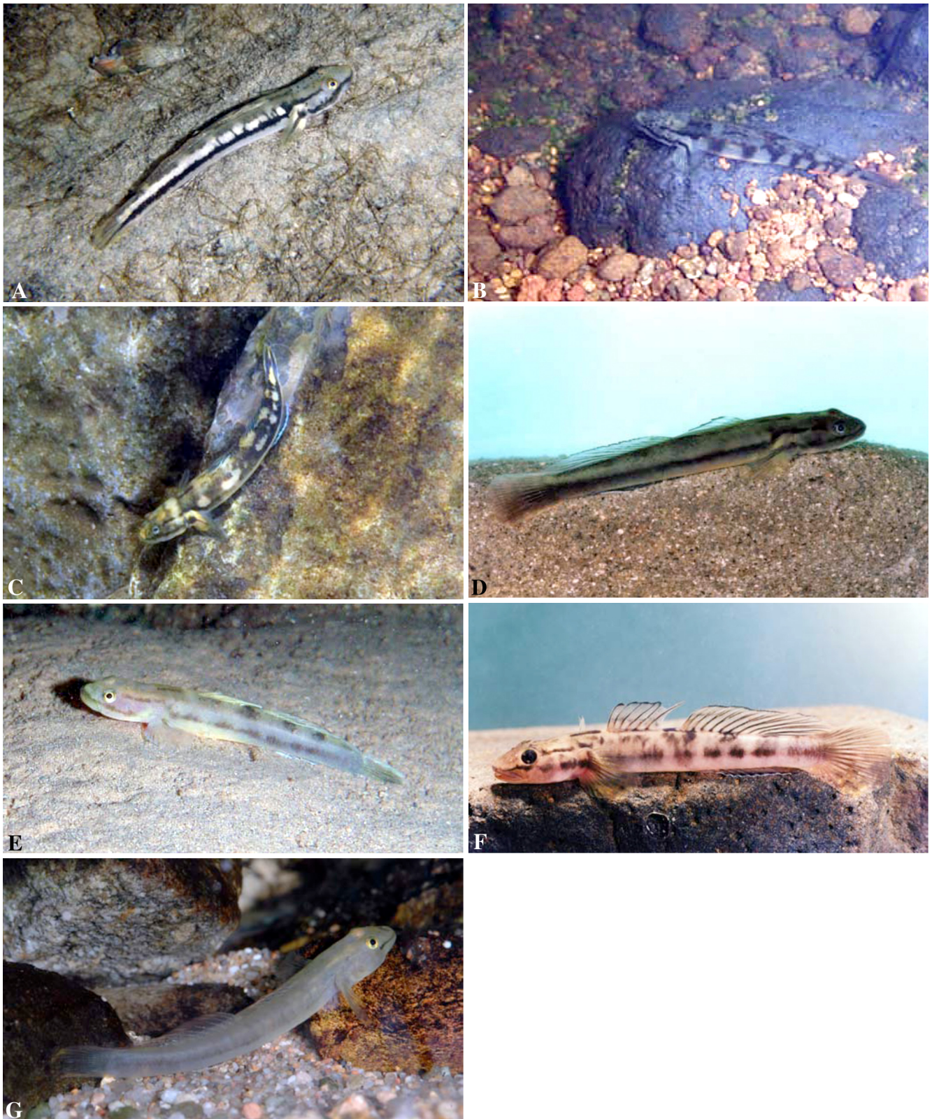
Figure 1. – Smilosicyopus species (males). A: S. chloe ; B: S. fehlmanni ; C: S. nigriradiatus ; D: S. sasali ; E: S. pentecost ; F: S. bitaeniatus ; G: S. leprurus.