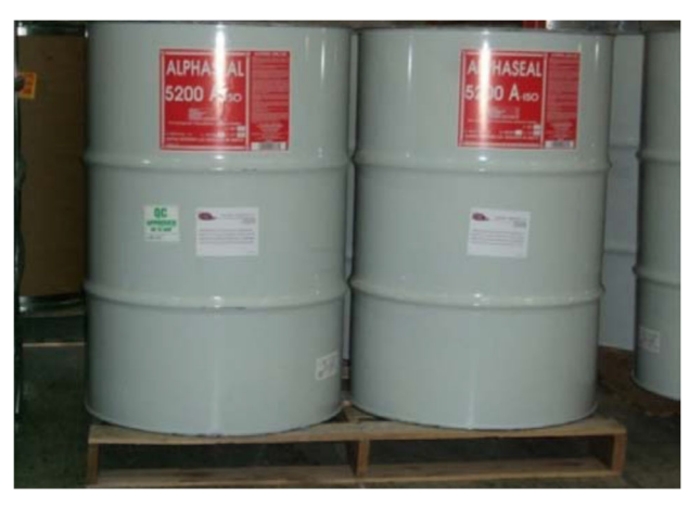
FIGURE 3-ALPHASEAL 5200 55 GALLON STEEL DRUMS