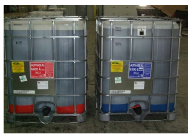
FIGURE 2—ALPHASEAL 5200 330 GALLON CAGED TOTES