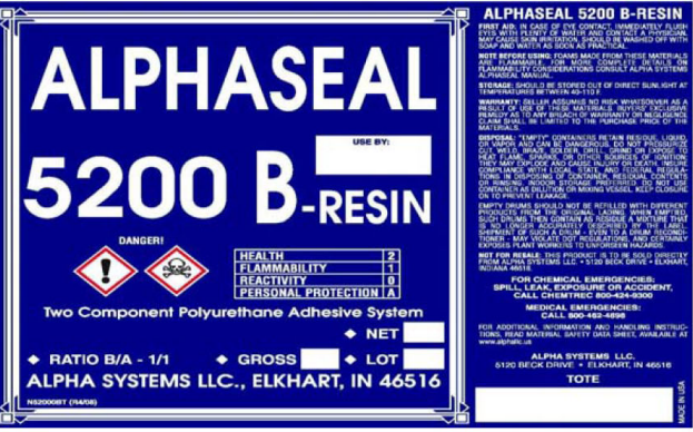
FIGURE 1-ALPHASEAL 5200 COMPONENTS