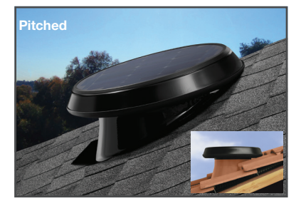
A great alternative for north facing roofs when you need to improve exposure to the sun.