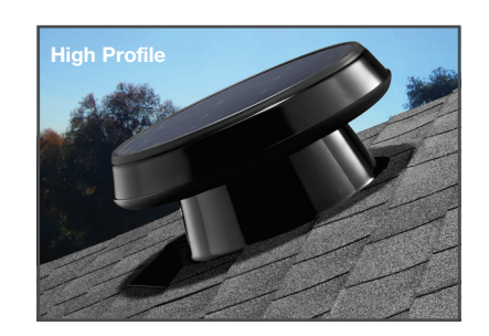
This unobtrusive, aerodynamic design is perfect for locations with heavy snow loads.

951642 V3.4_SolarStar SlimJim_DlrBrochure_Folded.indd 2