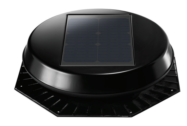
Typical Solar Star RM 1500 Application

The RM 1500 Solar Fan is the right choice when ventilating smaller spaces, especially in moderate or mild climates.