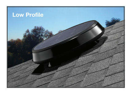
This sleek, discreet design works well for most roof applications.