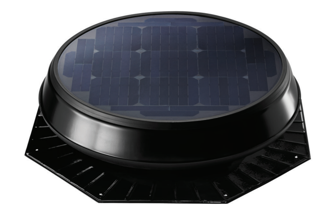
Typical Solar Star RM 2400 Application

The RM 2400 Solar Fan generates maximum power, making it the ideal solar-powered ventilation solution for larger spaces and extreme climates.