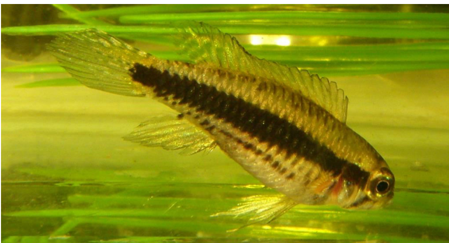
Female Black Stripe Dwarf Cichlid

Once fry become free-swimming, they can start on microworms and baby brine shrimp. Feed very sparingly but 2-3 times per day. I added snails and did water changes every day or 2 at this stage to minimize pollution. Later they were transferred to larger quarters with plain tapwater and plenty of plant cover where growth sped up and they reached maturity in 4-5 months at less than an inch. This generation of fry seemed infertile, and 3 pairs produced no fry. As this fish has a reputation of being very difficult to breed, possibly the harder tapwater used to raise them caused the infertility.