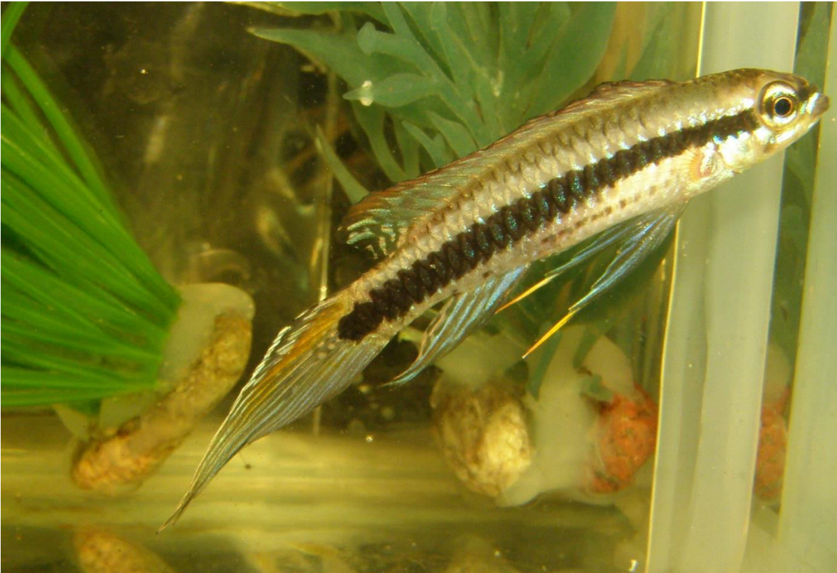
Male Black Stripe Dwarf Cichlid