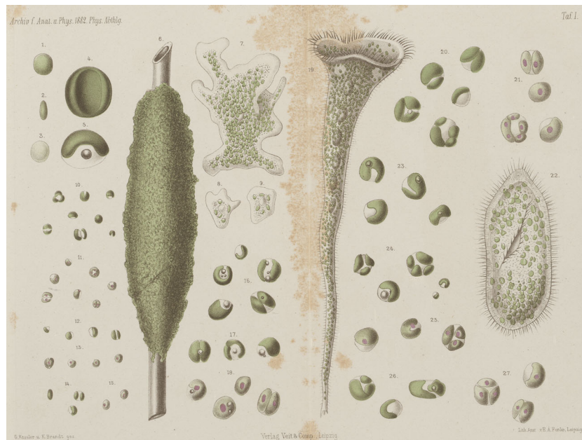
Fig. 1 Illustration of green cells found in animals (from Brandt 1882d). 1–3 Chlorophyll bodies of Lemna . Live within cell. 1600× magnification. 1 Top view, 2 Side view, 3 After treatment with alcohol and hematoxylin. (nucleus not present). 4–5 Schematic of green bodies (particularly from Hydra ). 4 Top view of chlorophyll body. 5 Side view of green body with starch grain below. 6 Spongilla , natural size. 7–9 Amoeboid cell of Spongilla . 10–16 and 20–27 Isolated green bodies. 1600× magnification. 10 Green bodies of Spongilla . 11 Green bodies of Spongilla , treated with hematoxylin. 12 Green bodies of planarian. 13 Green bodies of planarian, treated with hematoxylin. 14 Green bodies isolated from intestinal wall of Aeolosoma . 15 Green bodies isolated from

intestinal wall of Aeolosoma , treated with hematoxylin. 16 Green bodies from Hydra , occasionally with starch grain. 17 Green bodies from Hydra three weeks after isolation. 18 Green bodies from Hydra , treated with hematoxylin. 19 Stentor polymorphus with green bodies. 200× magnification. 20 Green bodies of Stentor polymorphus . 21 Green bodies of Stentor polymorphus , treated with hematoxylin. 22 Paramecium aurelia with green bodies. 500× magnification. 23 Green bodies of Paramecium aurelia . 24 Green bodies of Paramecium aurelia , four weeks after isolation. 25 Green bodies of Paramecium aurelia , treated with hematoxylin. 26 Green bodies of Vaginicola crystallina . 27 Green bodies of Vaginicola crystallina , treated with hematoxylin