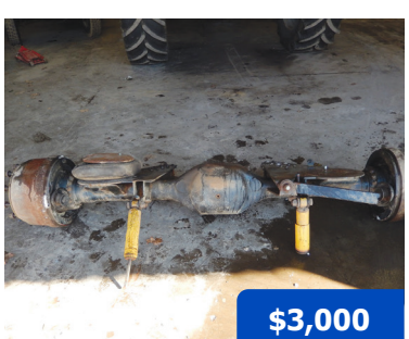
AxleTech Rear Axle, complete 99 in. rear axle. SN: 00054 (Landisburg, PA) BROKERED