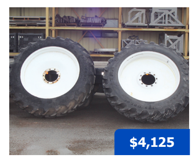
(2) Goodyear Row Crop Tires, 380/90R46, white, with 1 in. offset. Brand new! (PA)