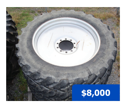
(4) Firestone Row Crop Tires and Rims, 380/90R46, white, with 1 in. offset. (PA)