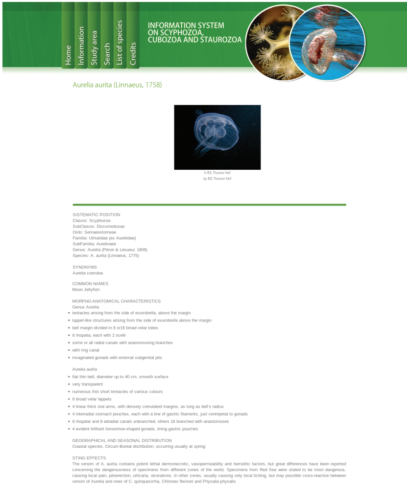
Figure 3. Taxon page. A typical taxon page displays an image, a description, as well as all the other images available in the system, together with credits and metadata. Taxon pages can host a virtually unlimited amount of data, links and media.