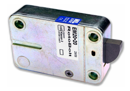
Suggested Entry Units