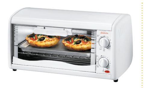
SUNBEAM® TOASTER COUNTERTOP OVEN 6198-099

Our toaster ovens bake, broil, toast, top brown and defrost. Simple to adjust temperature controls, timers and adjustable racks make them easy to use. Choose from our upscale Oster® oven with brushed stainless with 6-slice capacity (big enough for a large frozen pizza!) or our space-saving, compact Sunbeam® 4-slice capacity.