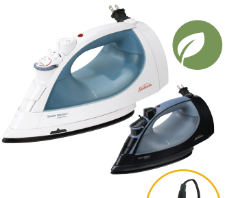
SUNBEAM® STEAM MASTER® RETRACTABLE IRON 4274-099 (White) 4275-099 (Black)