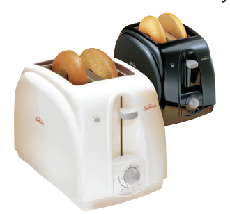
SUNBEAM® 2-SLICE TOASTER 3822-099 (White) 3910-099( Black)

A fresh start to the day begins with a hearty and balanced breakfast. Guests can toast just about anything from bread to muffins and bagels in one of our compact and functional toasters. The extra wide slots allow for maximum versatility for whatever's on the menu. Get that perfect, golden crisp time and time again.