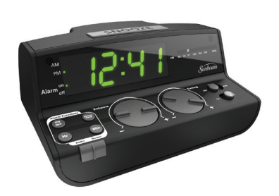
SUNBEAM® CLOCK RADIO W/ DAILY ALARM RESET CR1001-005