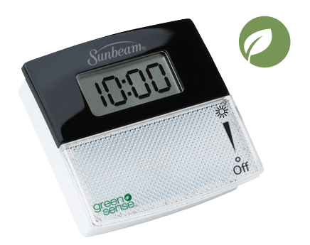
SUNBEAM® GREENSENSE™ LED NIGHTLIGHT 1800-099

Help your guests wake up promptly and refreshed with a Sunbeam® clock radio. Our newest model, the Sunbeam® Elite clock radio couldn't be easier for a guest to use – with innovative voice commands and voice confirmation designed to help the guest quickly set the alarm and give them confidence it is just the way they want it. Plus, we've added features specifically for hotel guests, such as Nap, White Noise and a Seek function for the radio. And the CR1001 and CR1003 models feature a Daily Alarm Reset, so no risk of waking up to a prior guest's alarm. Music choices? We've got that too, with an iPod dock, aux audio jack and AM/FM radio. Getting a good night's sleep just got easier.