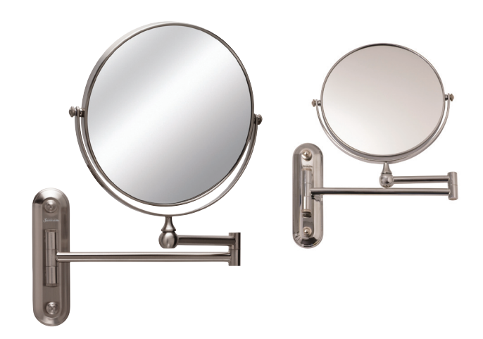
SUNBEAM™ WALL-MOUNT MIRROR 1616 (Brushed Satin) 1618 (Chrome)

When away from home, people still want to rest assured they can put their best and freshest face forward to start the day. An in-room wall-mount or tabletop mirror is a convenient way to offer the added assurance that everything is in check.