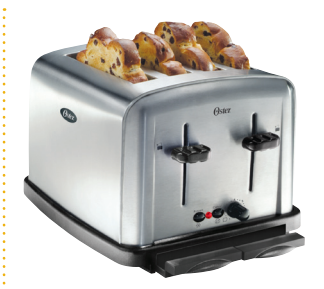
OSTER® 4-SLICE TOASTER 6334-099 (Brushed Stainless)