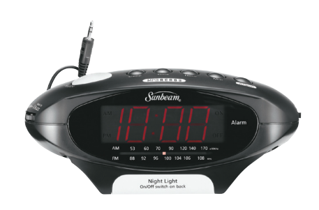
SUNBEAM® MP3 READY ALARM CLOCK RADIO 89020