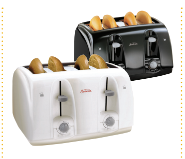
SUNBEAM® 4-SLICE TOASTER 3823-099 (White) 3911-099 (Black)