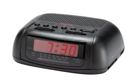
SUNBEAM® AM/FM CLOCK RADIO 89014