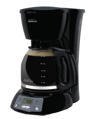
SUNBEAM® PROGRAMMABLE 12-CUP COFFEEMAKER BVSB-TGX23-099