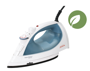
SUNBEAM® STEAM MASTER® IRON 4273-099