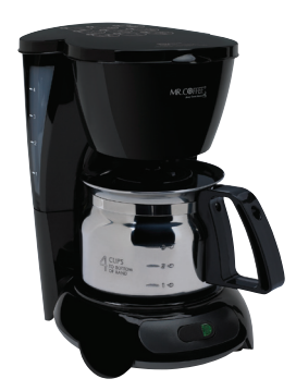
MR. COFFEE® 4-CUP COFFEEMAKER TF5-080