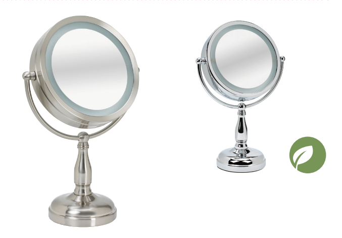
SUNBEAM™ LIGHTED TABLETOP MIRROR W/ AUTO-OFF MR3700-060 (Brushed Satin) MR3700-098 (Chrome)