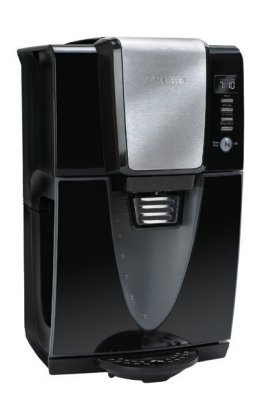
MR. COFFEE® 12-CUP CARAFE-LESS COFFEEMAKER BVMCZH-099