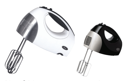
OSTER® 6-SPEED HAND MIXER W/ RETRACTABLE CORD 2534-099 (White) 2577-099 (Black)

Oster® Hand Mixer hosts the power of 6 speed settings, a 250 watt motor and is stylishly designed in black or white with chrome-plated beaters. Retractable cord for easy storage and 4 different style beaters for cooking versatility.