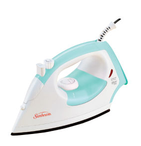
SUNBEAM® STEAM IRON 3985-099

Sunbeam® Hospitality irons are renown for their quality and performance, and this year's lineup is no exception. With durable non-stick soleplates and features such as secure retractable cords, self-cleaning, Safe Storage Strips, and Motion Smart® 3-way Auto-Off – our irons are a smart choice for value and safety. Your guests will love the versatility and crisp look they can get with our Vertical Steam, Shot of Steam® and Spray Mist® Functions, and with our drip-free technology, water only goes where you want it. Plus, 7 of our irons are greensense™ products, designed to deliver water savings of up to 45% vs a standard iron.