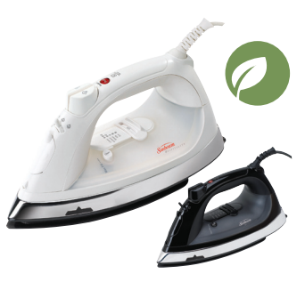
SUNBEAM® STEAM IRON 3017-099 (White) 3018-099 (Black)