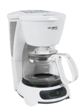
MR. COFFEE® 4-CUP COFFEEMAKER TF4-099