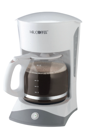
MR. COFFEE® 12-CUP COFFEEMAKER SK12-099 (White) SK13-099 (Black)