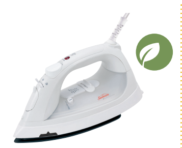
SUNBEAM® STEAM IRON 3016-099