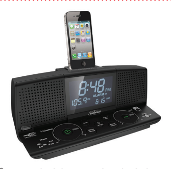
SUNBEAM® ELITE CLOCK RADIO W/ VOICE INSTRUCTIONS, IPOD DOCK & DAILY ALARM RESET CR1003-005