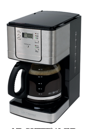
MR. COFFEE® 12-CUP COFFEEMAKER W/ WATER FILTER JWX31-099