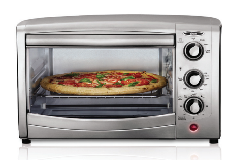
OSTER® 6-SLICE BRUSHED STAINLESS CONVECTION COUNTERTOP OVEN TSSTTVRB04-099