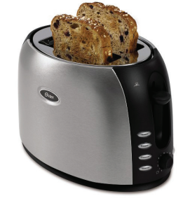
OSTER® 2-SLICE TOASTER TSSTJC5BBK-099 (Brushed Stainless)