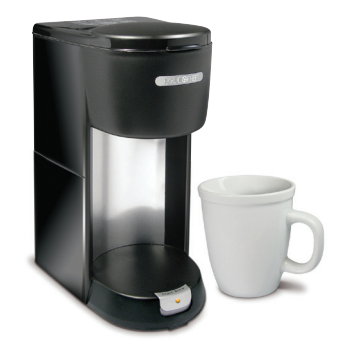
MR. COFFEE® 1-CUP COFFEEMAKER PTC13-100

Whether it's used as a morning ritual or a mid-day 'pick-me-up' coffee is a daily staple for many. Our entire coffeemaker collection has been designed with special attention to all the right features to brew the most delicious cup of coffee possible - like brew temperature, brew time, and flavor sealed lids. We also make clean up easy with dishwasher safe carafes, brew baskets and non-stick warming plates standard on all carafe models. Whether you are looking for a compact, efficient one-cup brewer or an upscale programmable 12-cup with stainless accents, we have a coffeemaker for you.