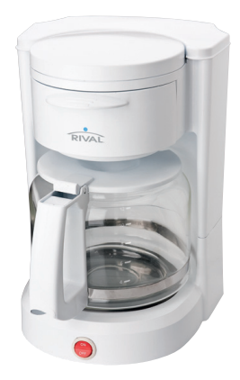
RIVAL® 12-CUP COFFEEMAKER BVRVDC12-099