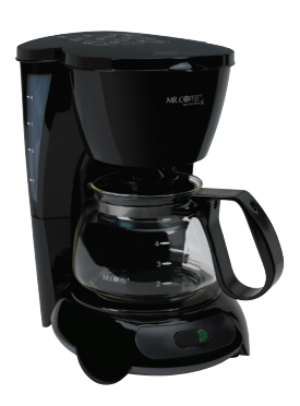
MR. COFFEE® 4-CUP COFFEEMAKER TF5-099