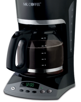
MR. COFFEE® PROGRAMMABLE 12-CUP COFFEEMAKER SKX20-099 (White) SKX23-099 (Black)